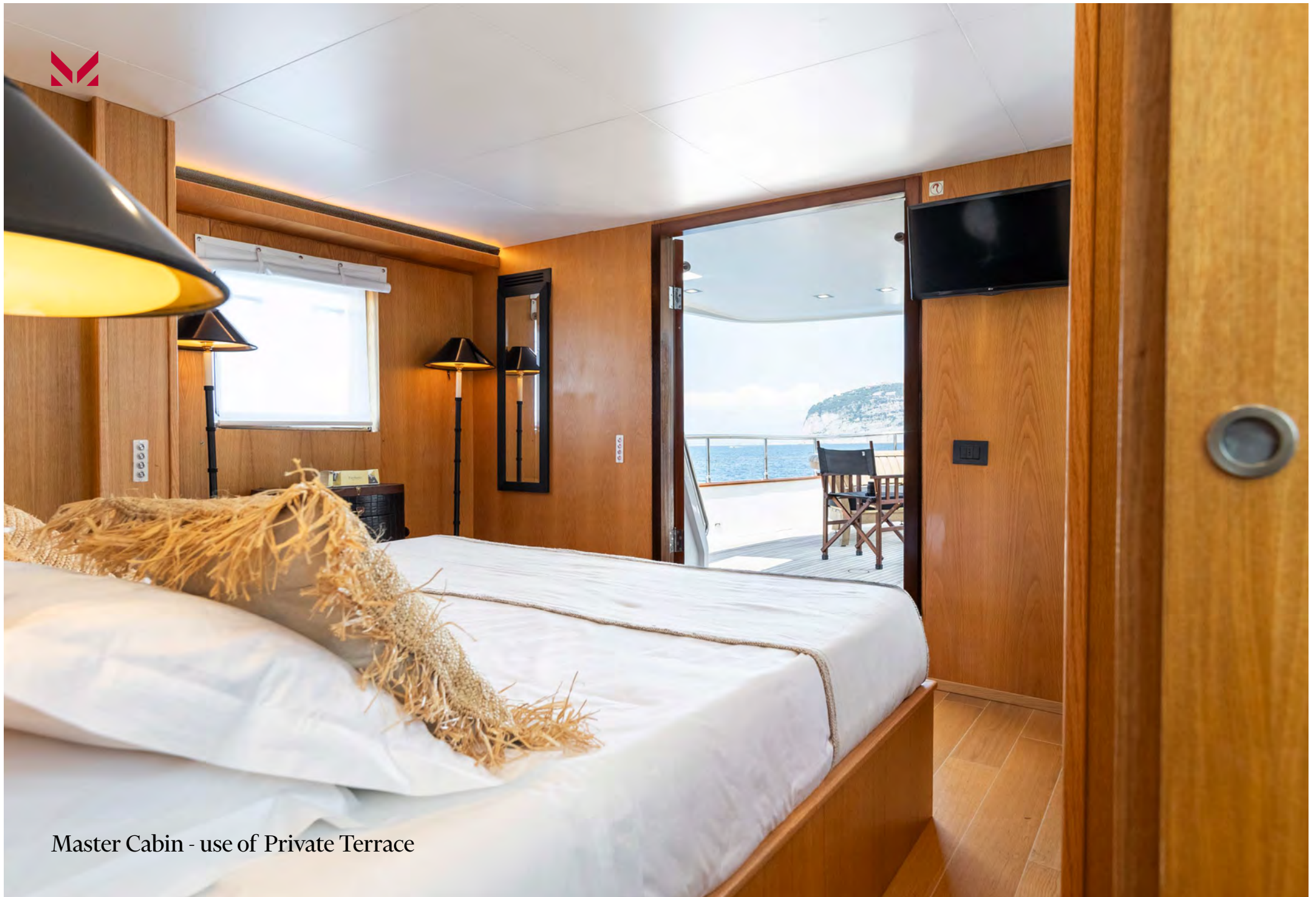
Master Cabin - use of Private Terrace