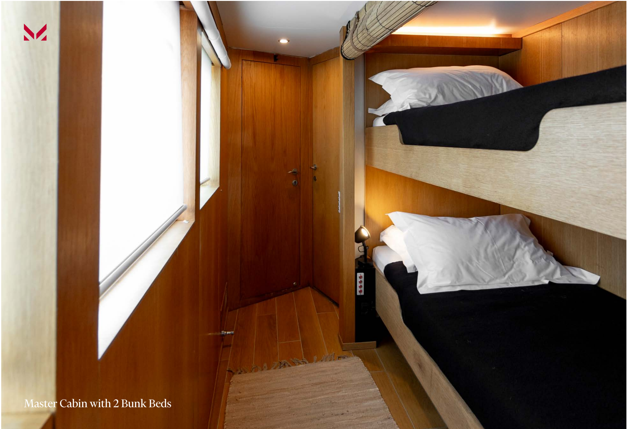
Master Cabin with 2 Bunk Beds