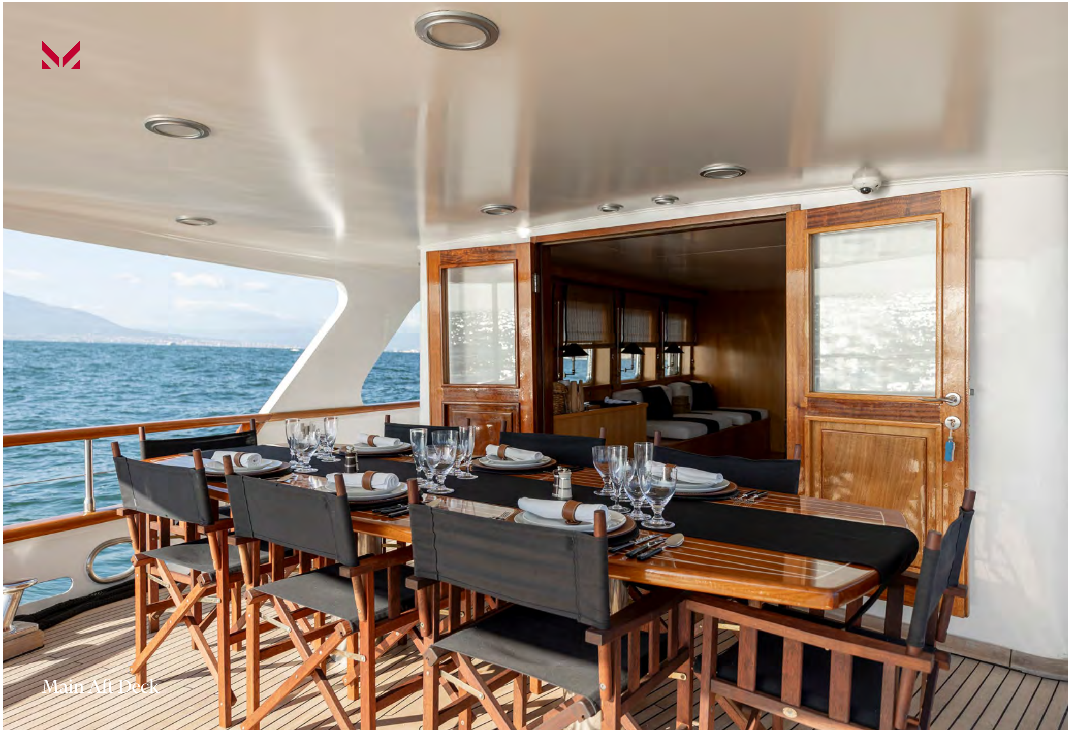
Main Aft Deck