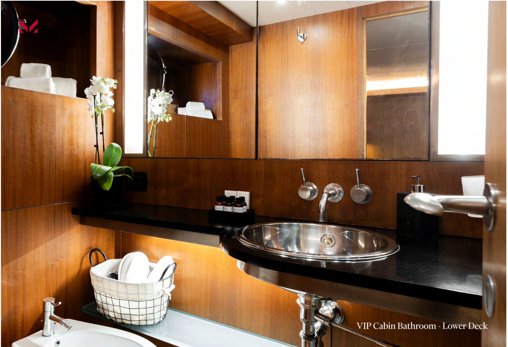
VIP Cabin Bathroom - Lower Deck