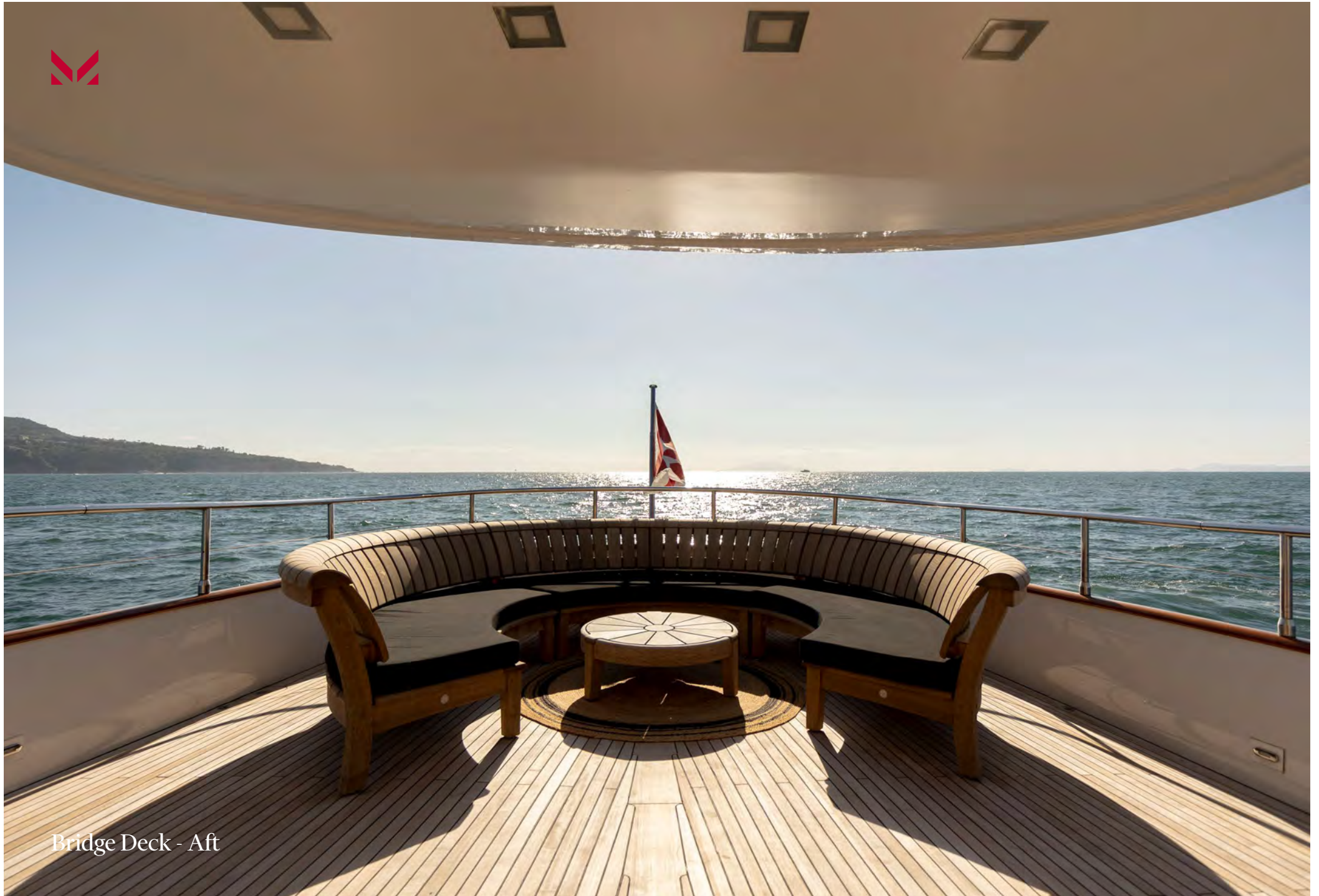
Bridge Deck - Aft