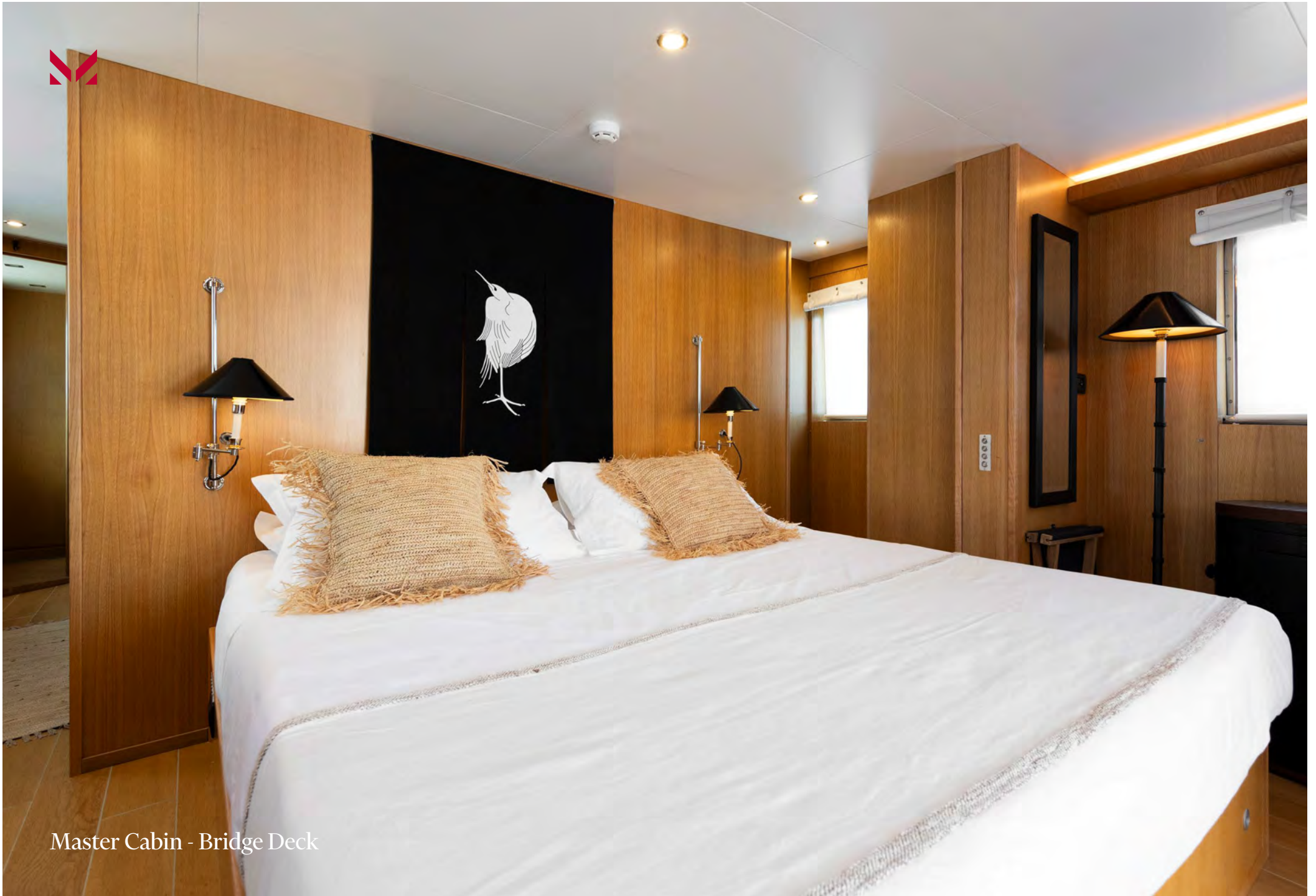
Master Cabin - Bridge Deck