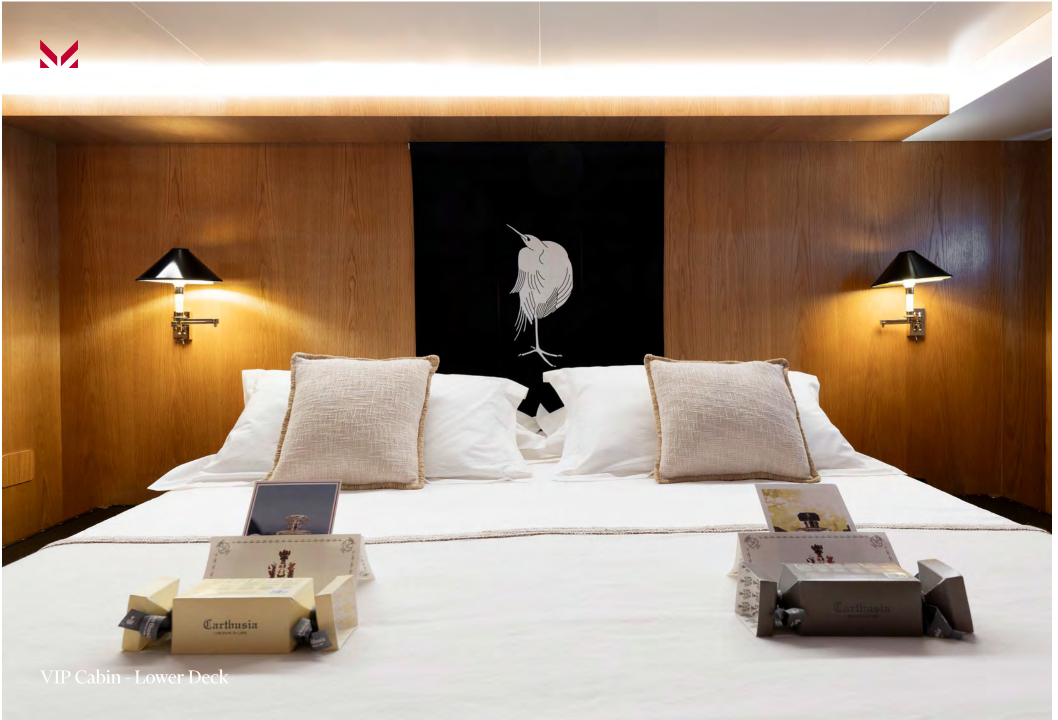
VIP Cabin - Lower Deck