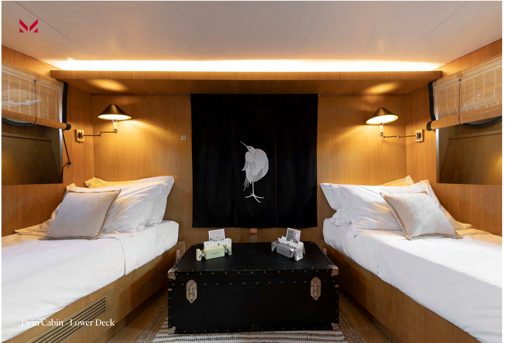
Twin Cabin - Lower Deck