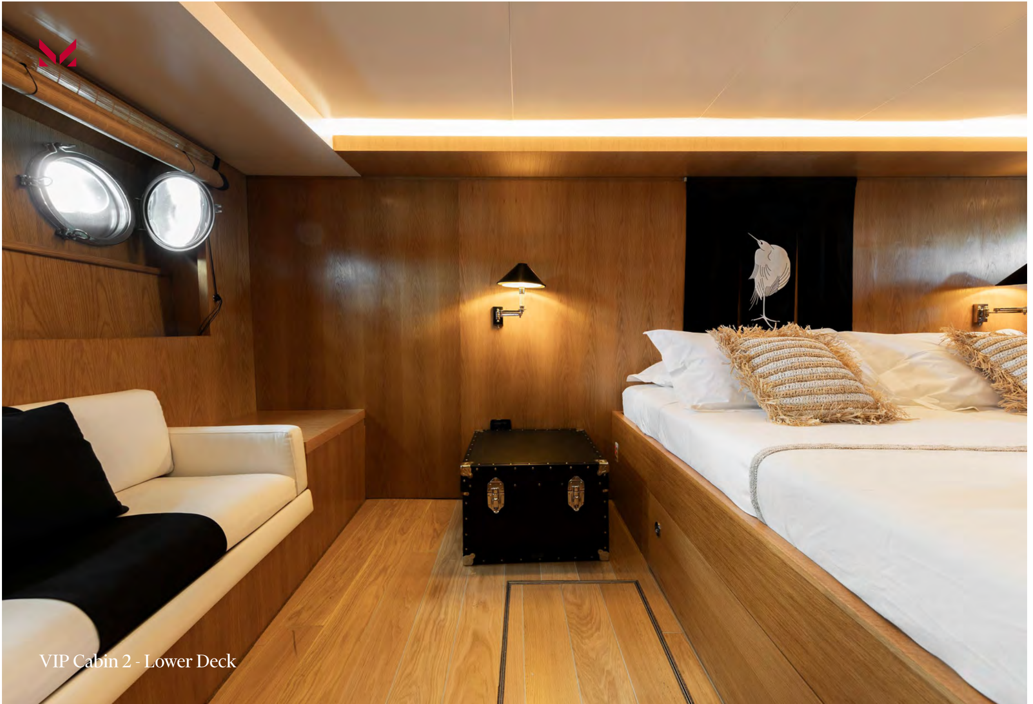
VIP Cabin 2 - Lower Deck