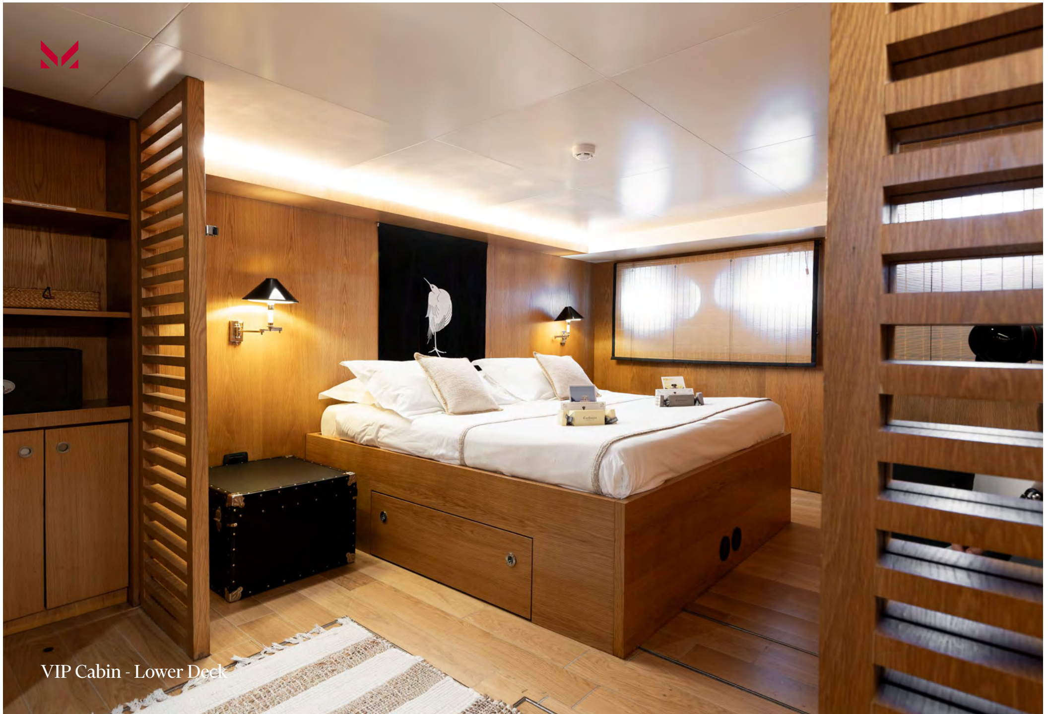
VIP Cabin - Lower Deck