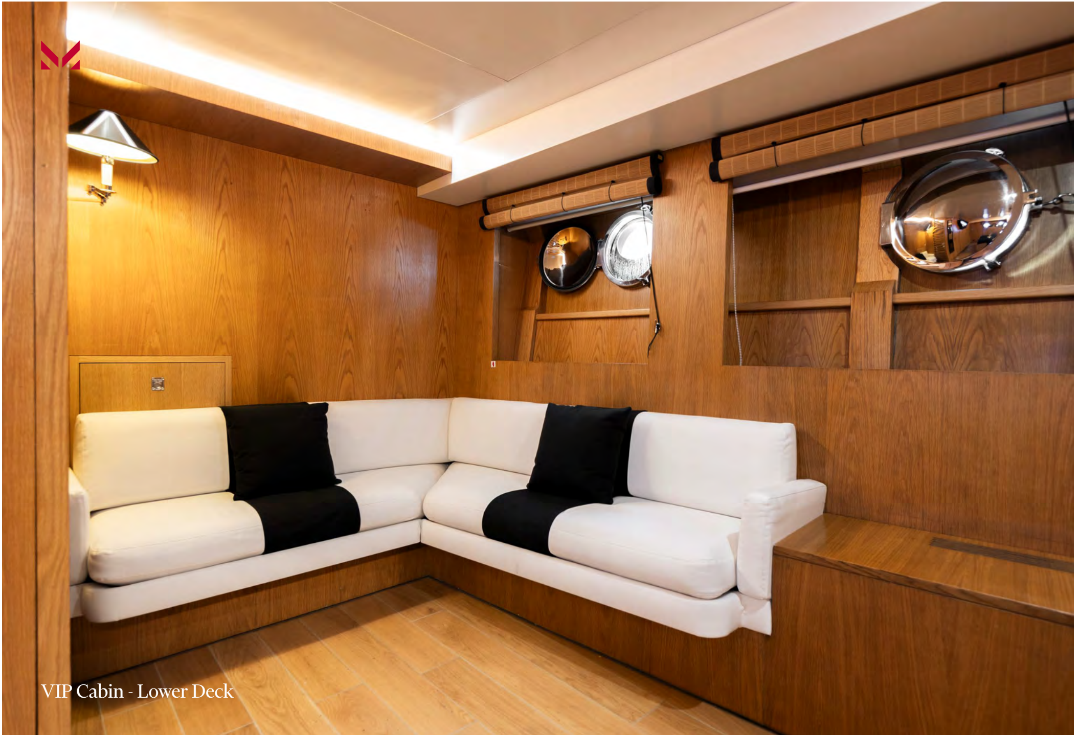
VIP Cabin - Lower Deck