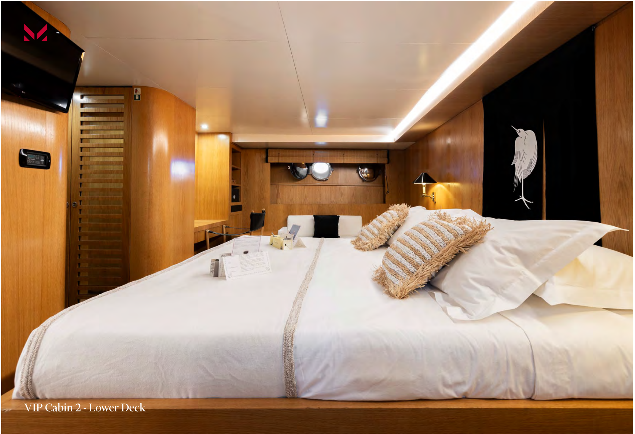
VIP Cabin 2 - Lower Deck