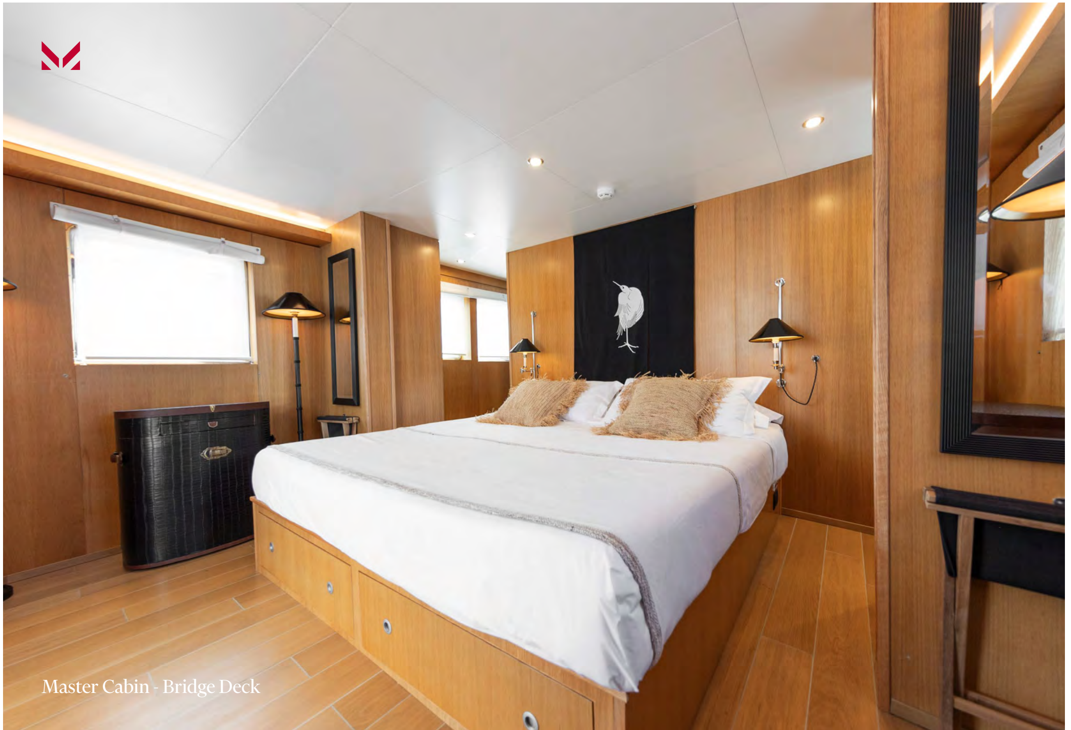
Master Cabin - Bridge Deck