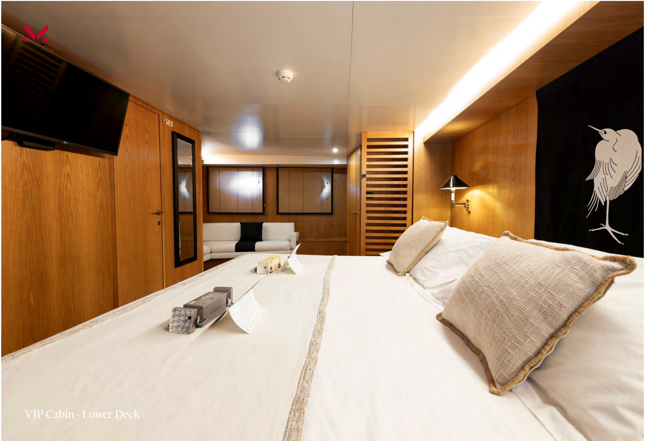
VIP Cabin - Lower Deck