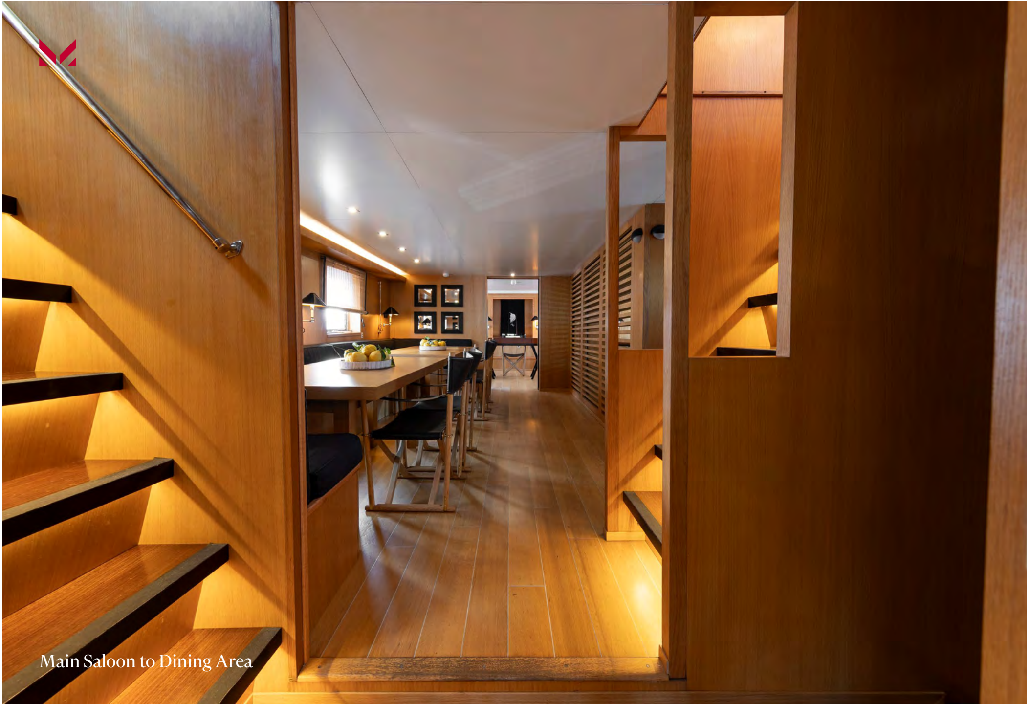
Main Saloon to Dining Area