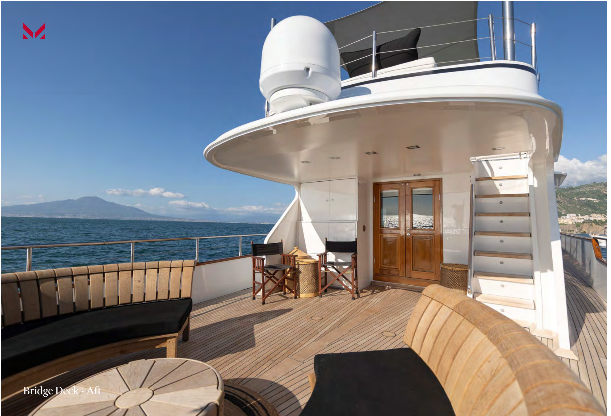
Bridge Deck - Aft