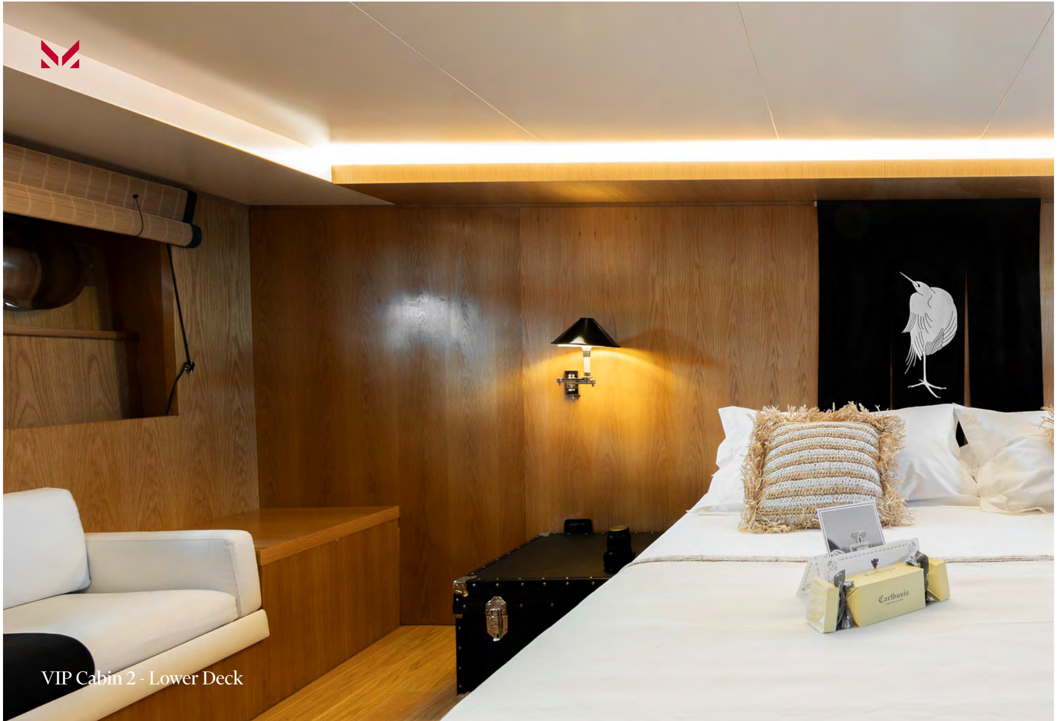
VIP Cabin 2 - Lower Deck