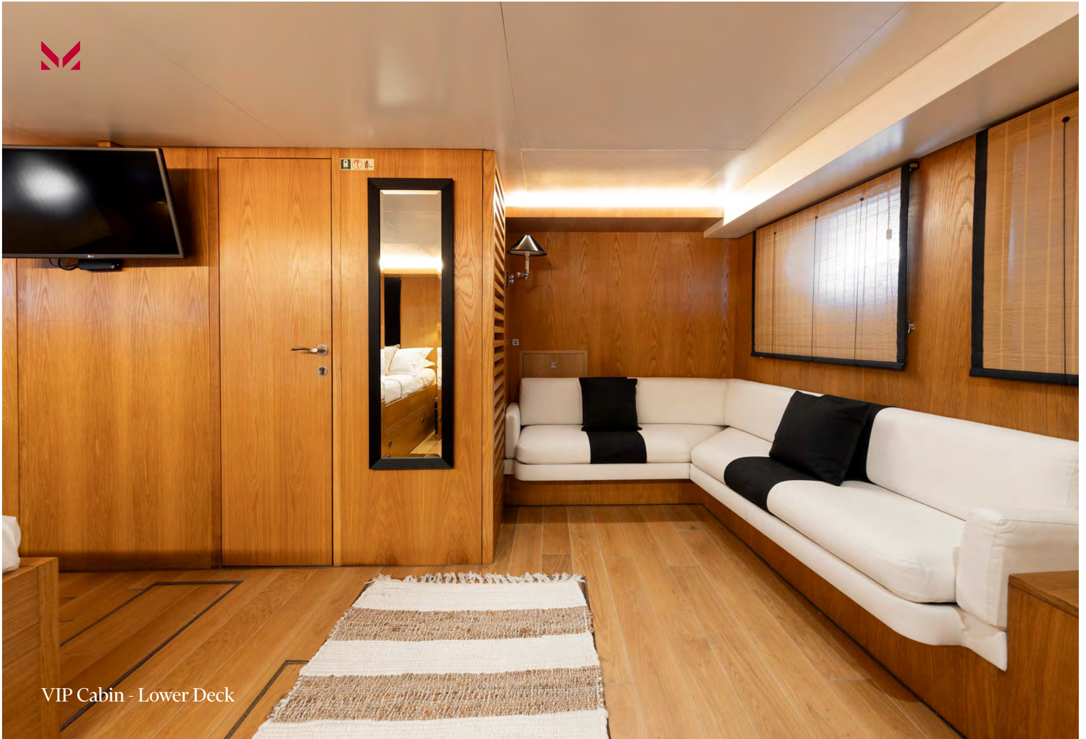
VIP Cabin - Lower Deck