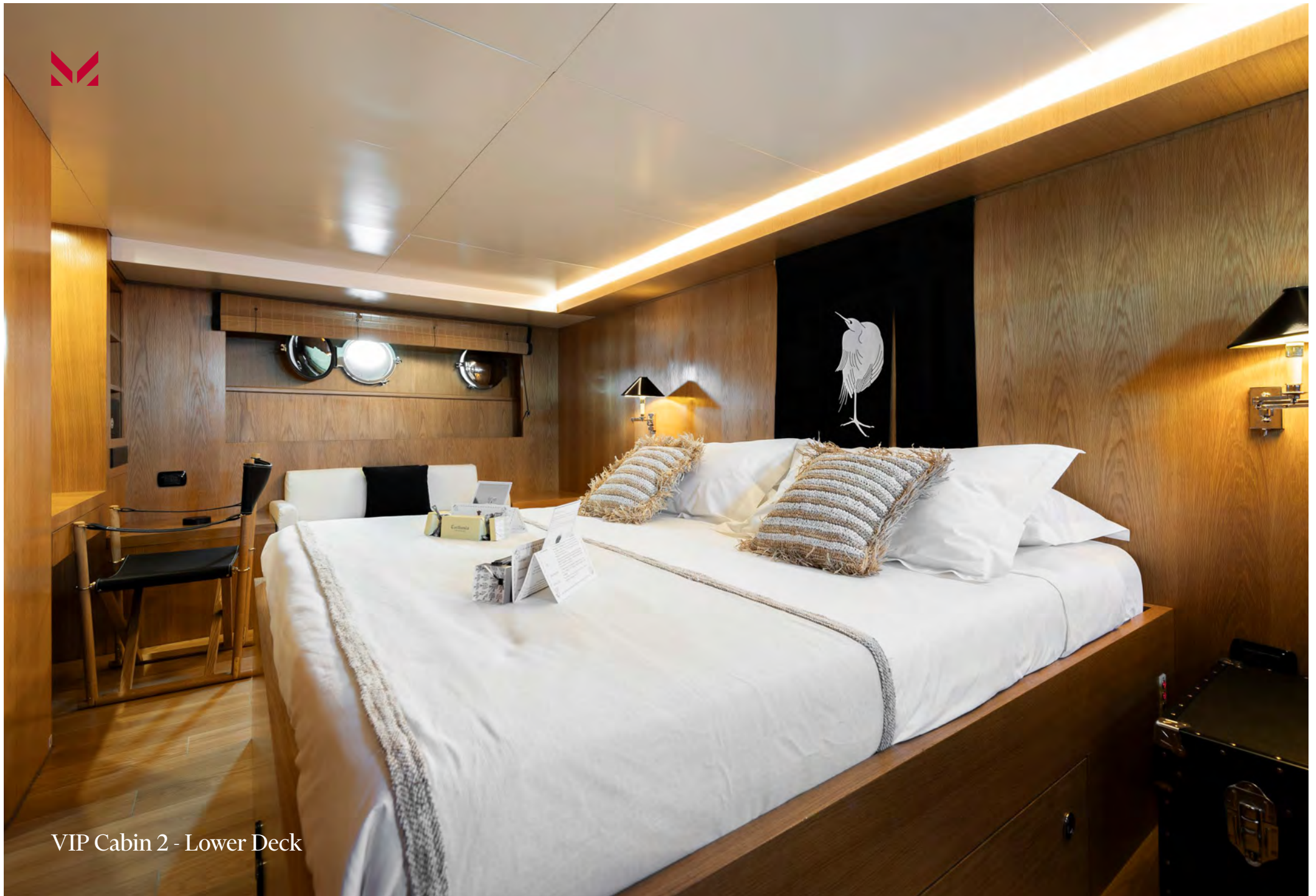
VIP Cabin 2 - Lower Deck