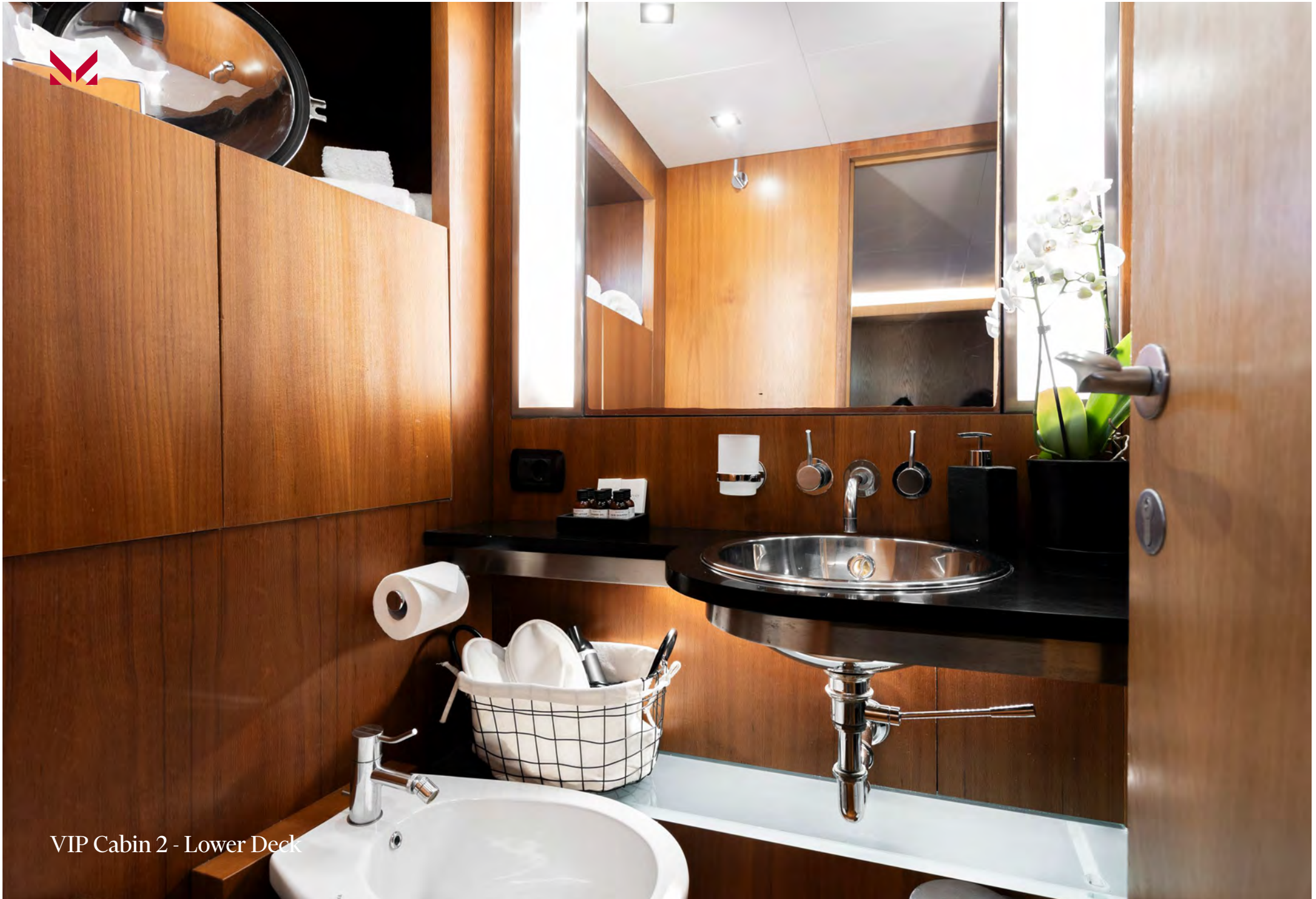
VIP Cabin 2 - Lower Deck