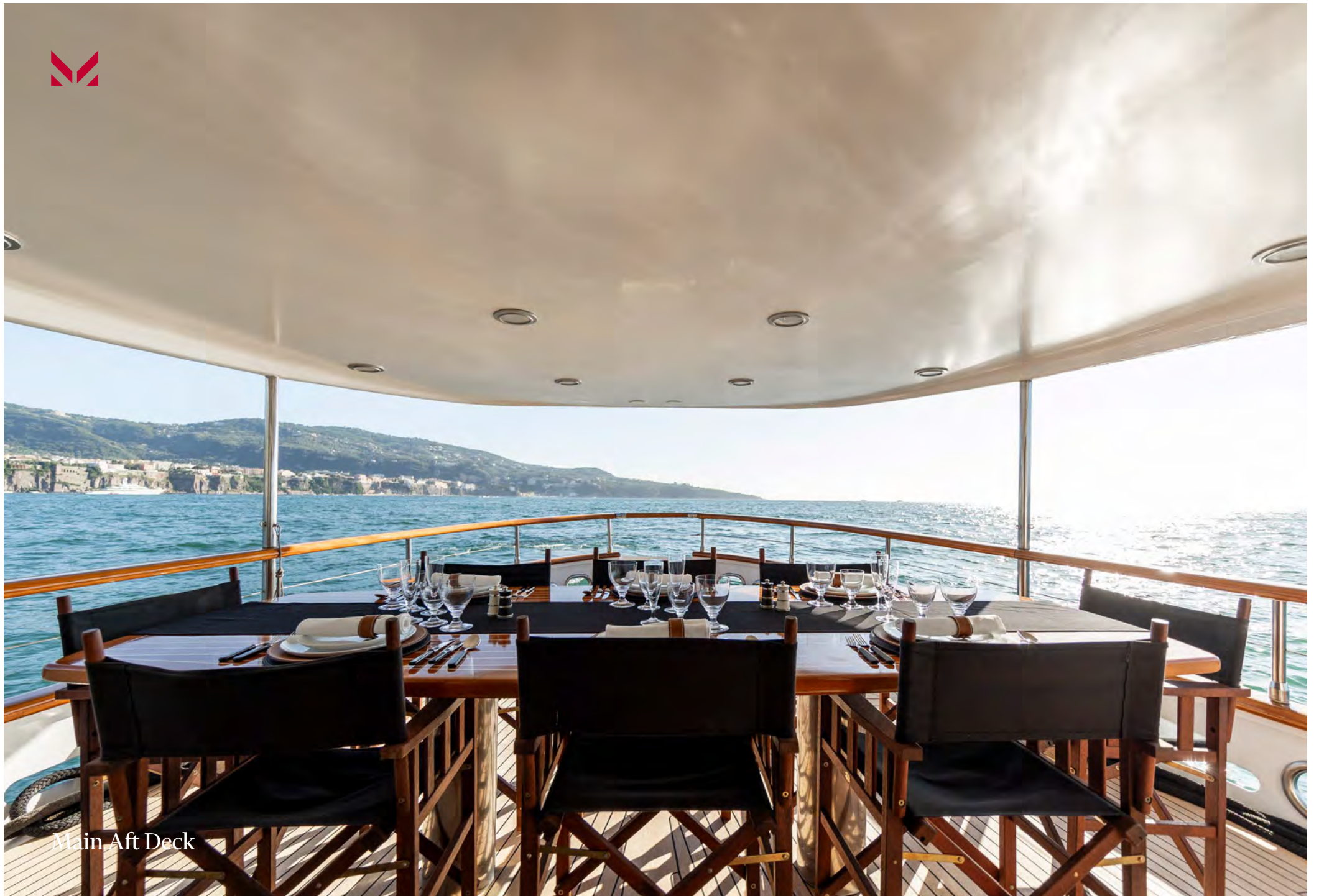
Main Aft Deck