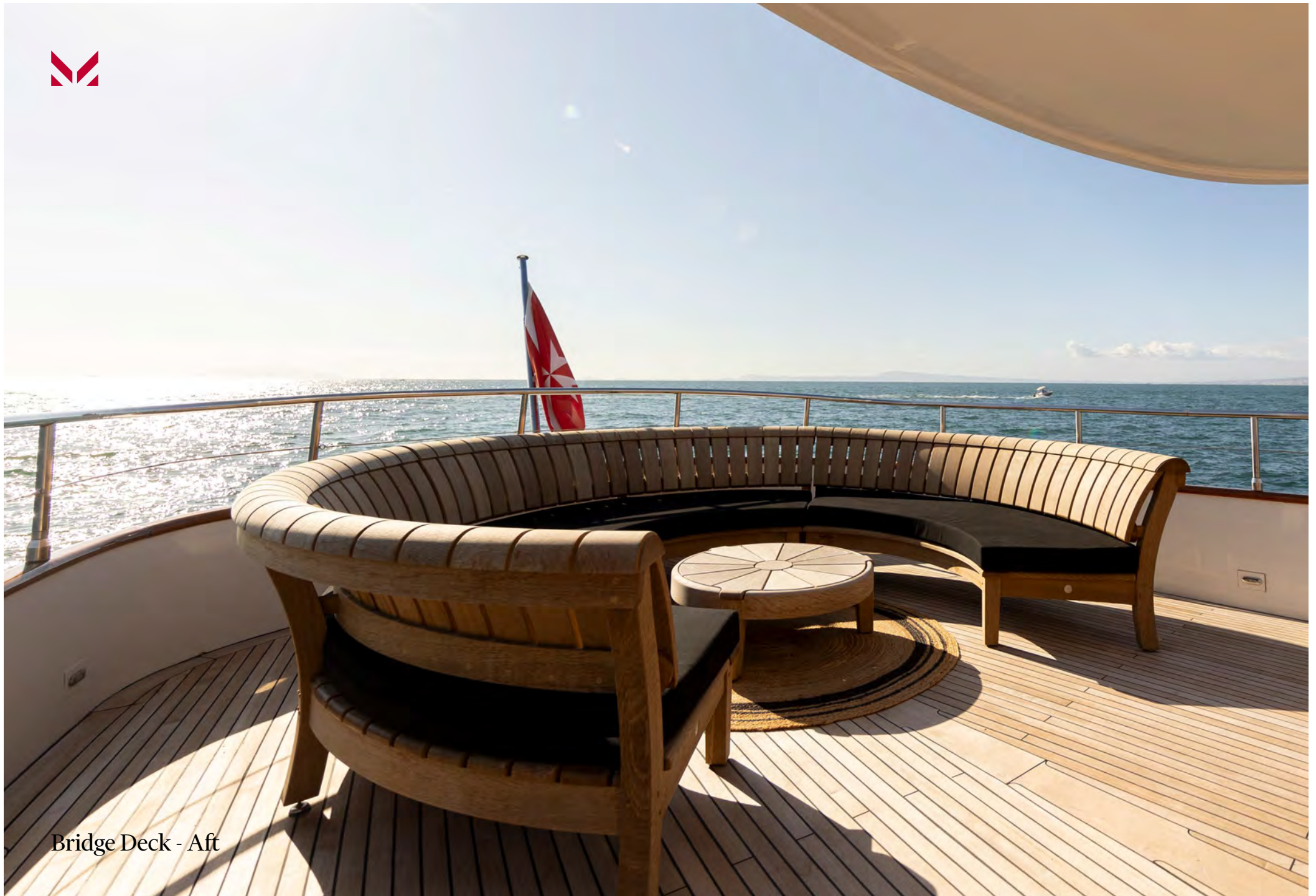
Bridge Deck - Aft