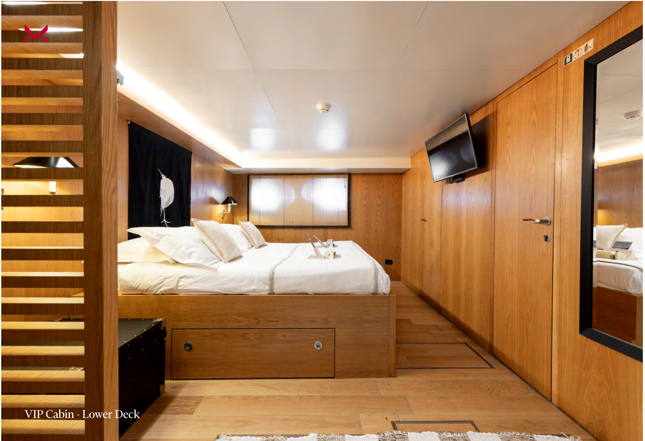
VIP Cabin - Lower Deck