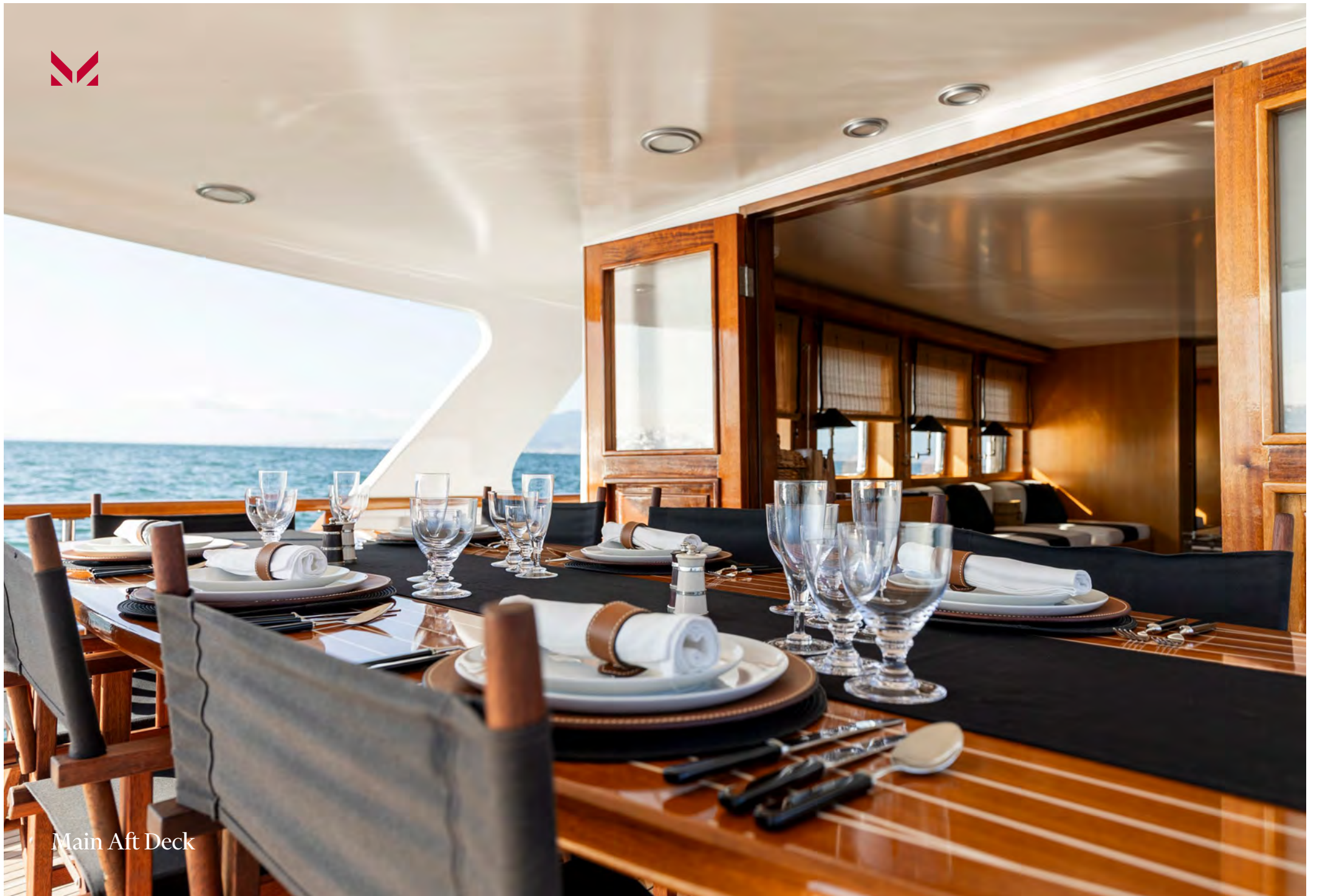
Main Aft Deck