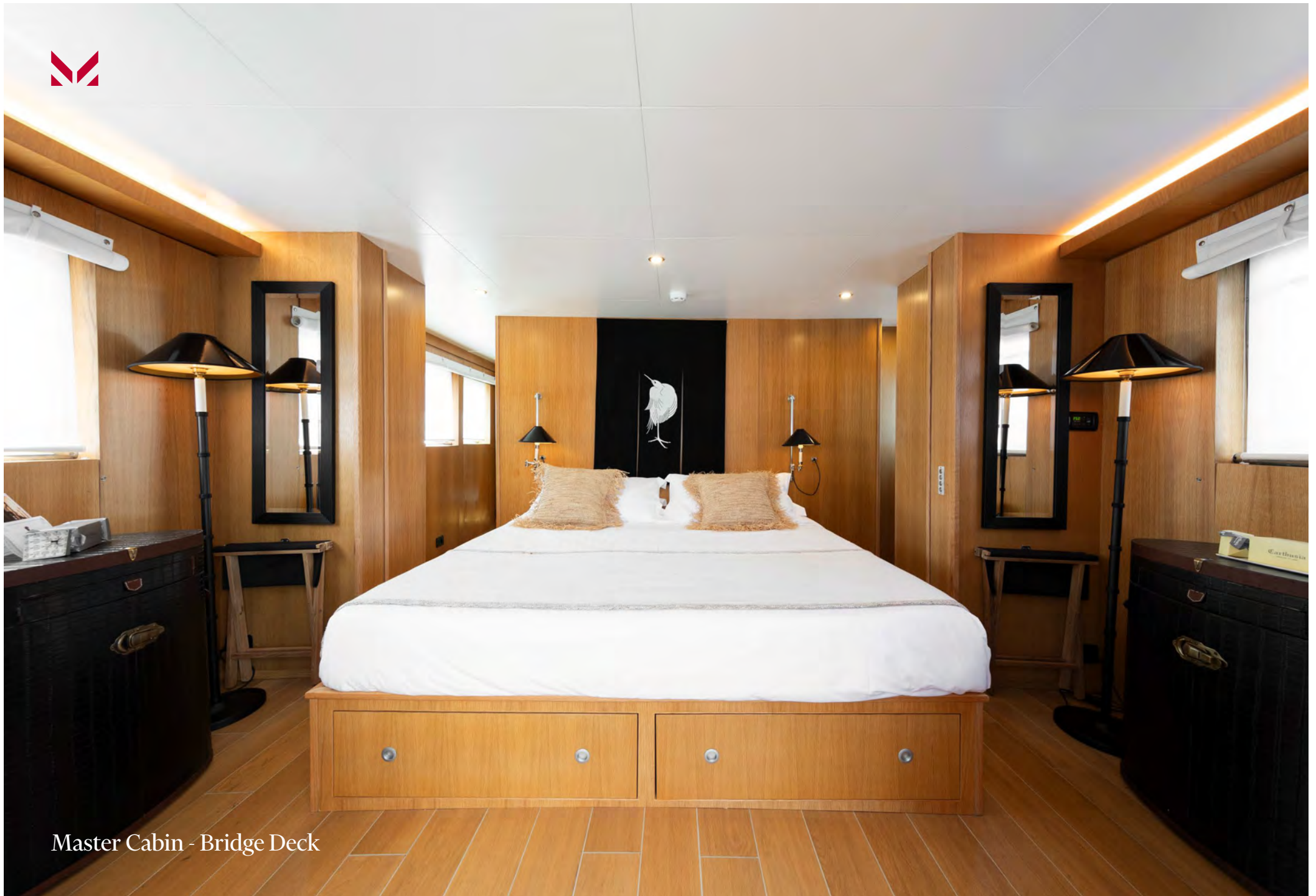
Master Cabin - Bridge Deck