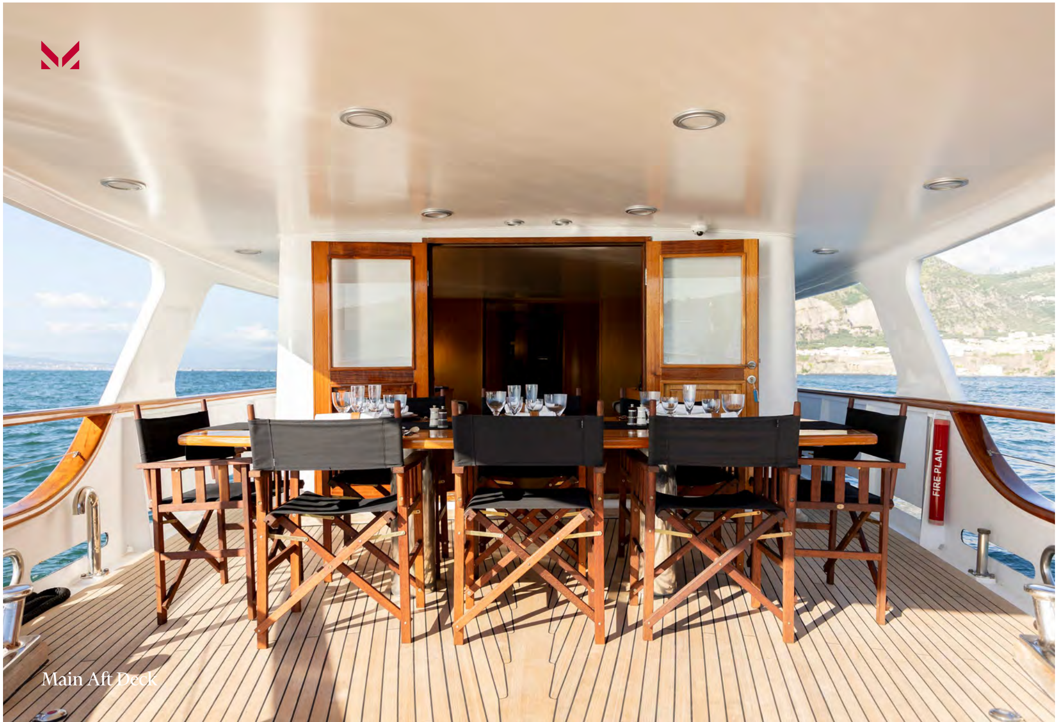
Main Aft Deck