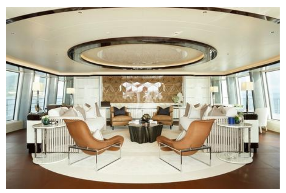
Sky lounge facing forwards