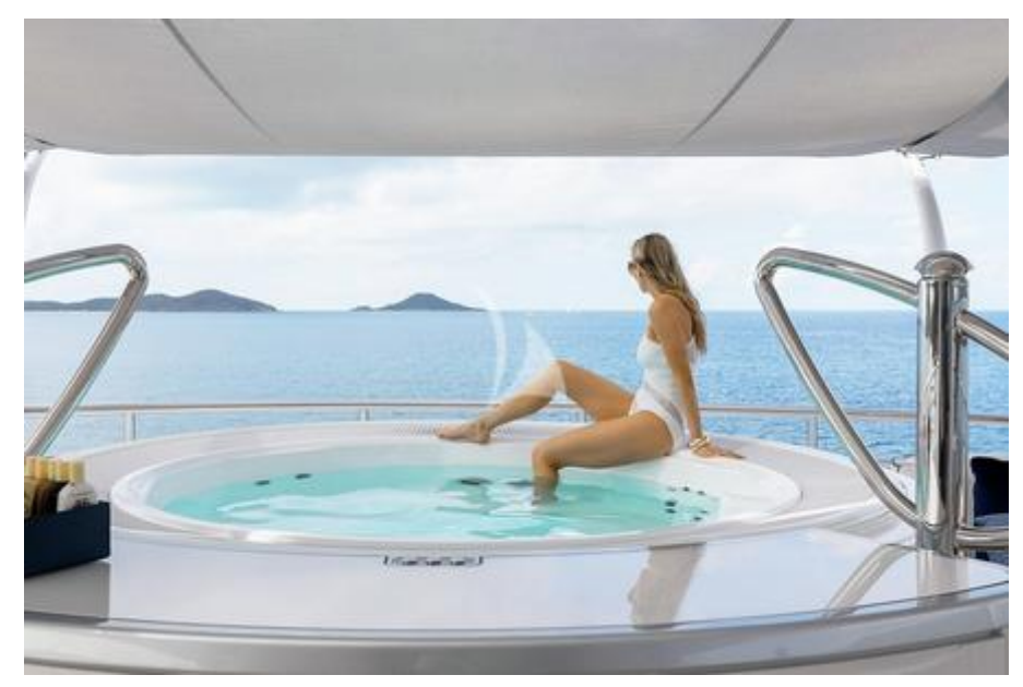
Owner's deck jacuzzi