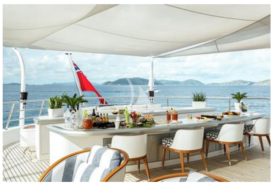
Bridge deck aft