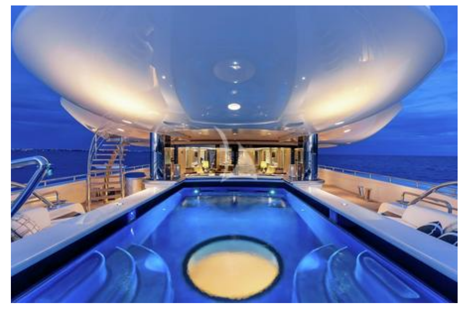
Main deck aft pool