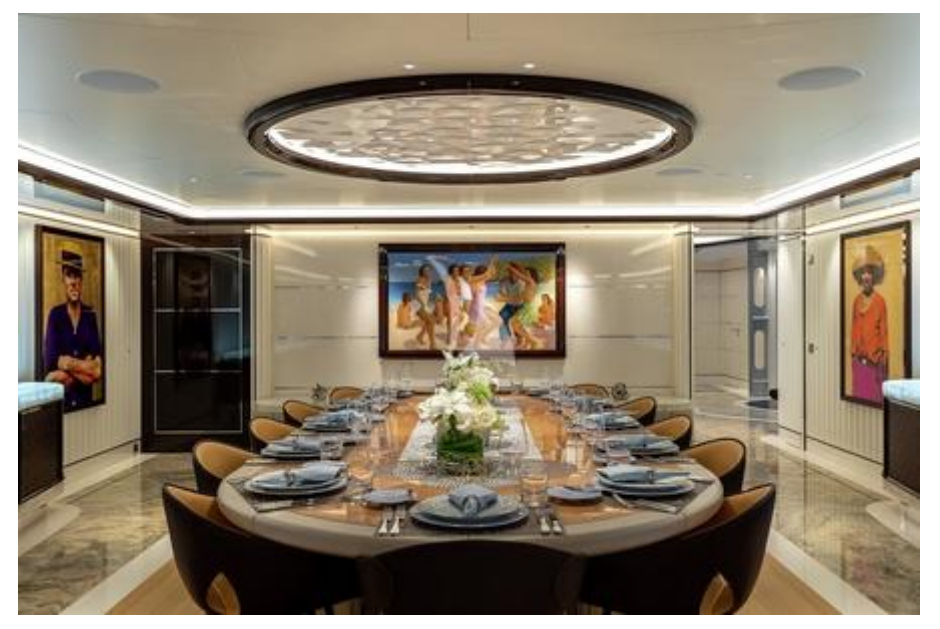
Main deck dining room