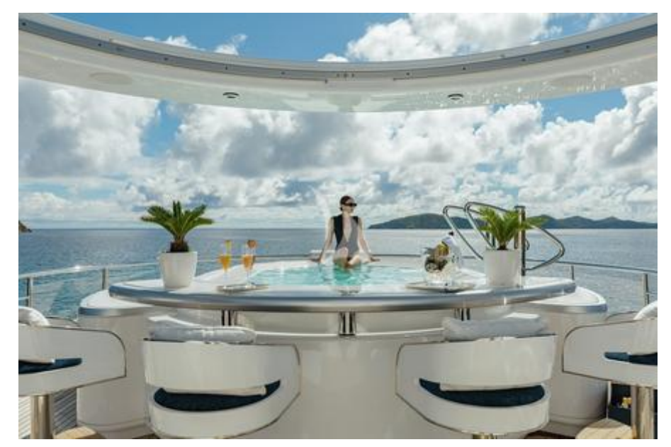
Sun deck jacuzzi