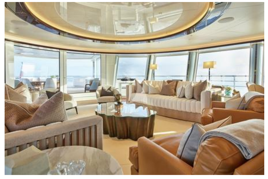
Sky lounge facing aft