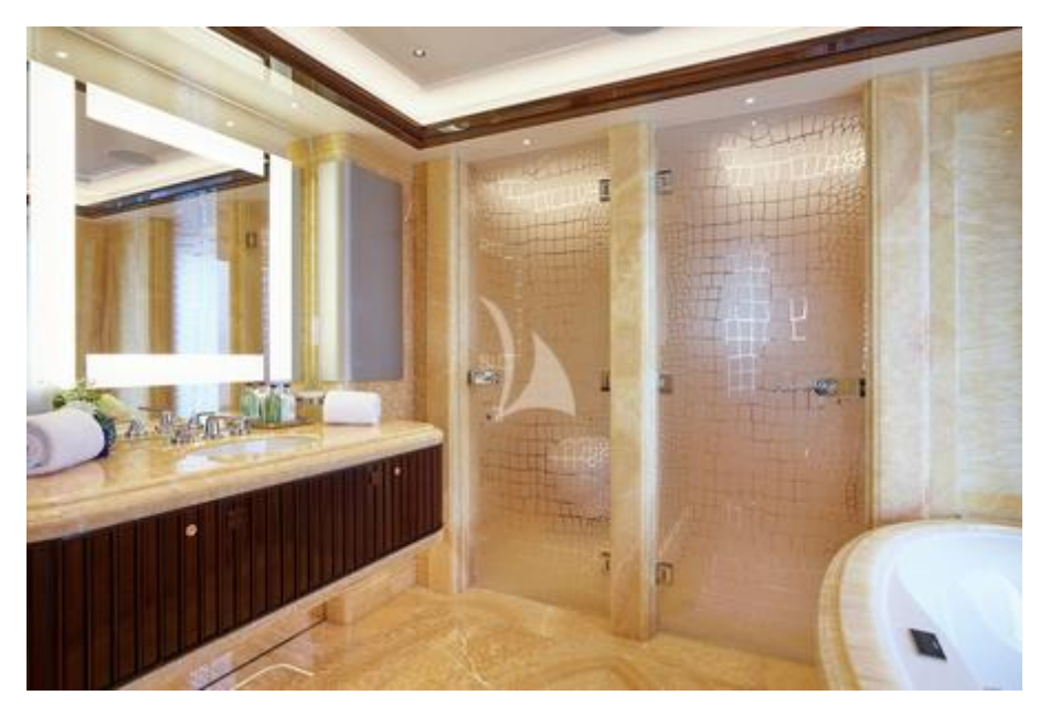
Master shower room en suite