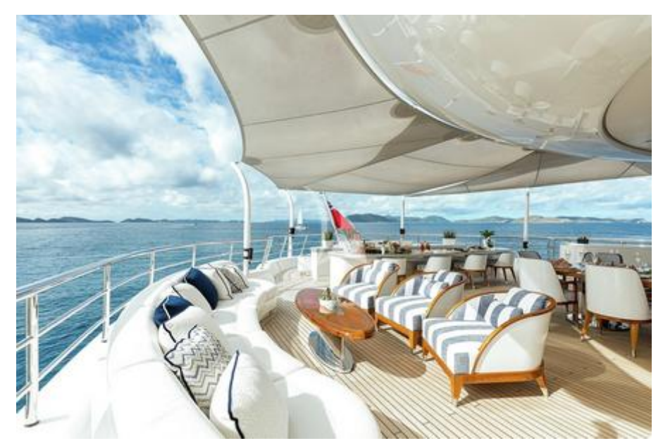
Bridge deck seating area