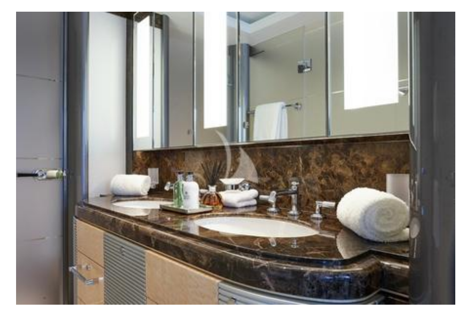
Double shower en suite shower room