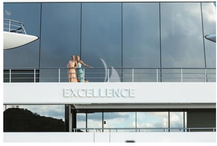
Triple height atrium