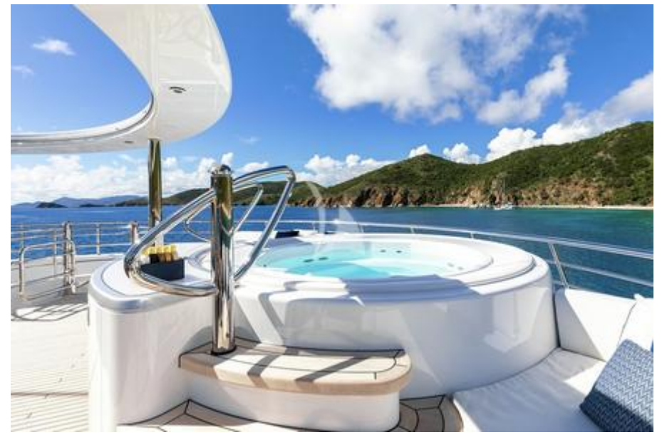
Owner's deck jacuzzi