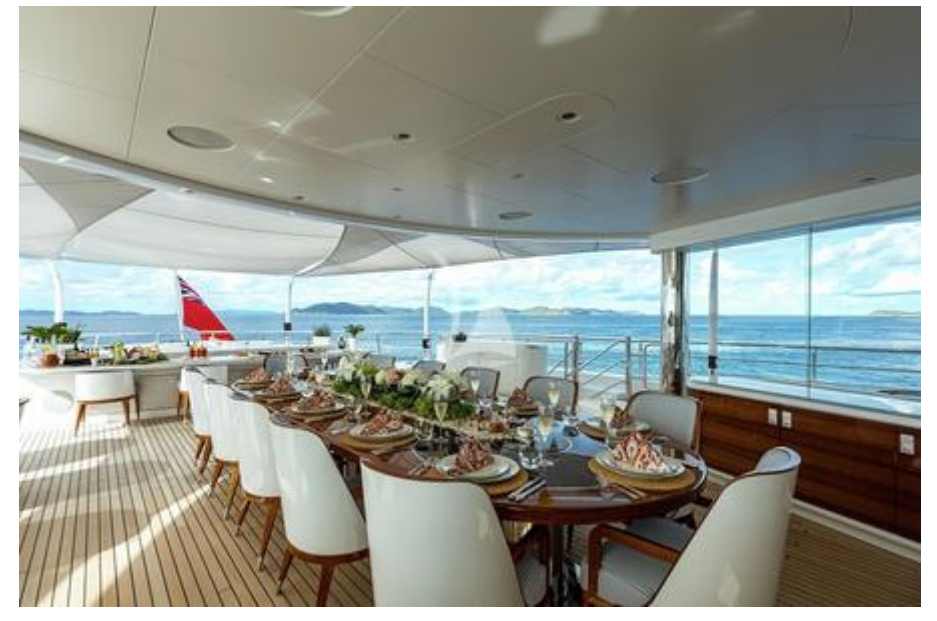
Bridge deck dining area