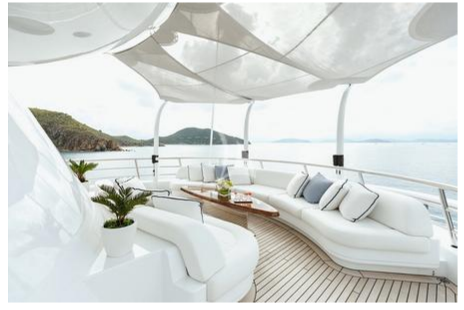
Sun deck seating area