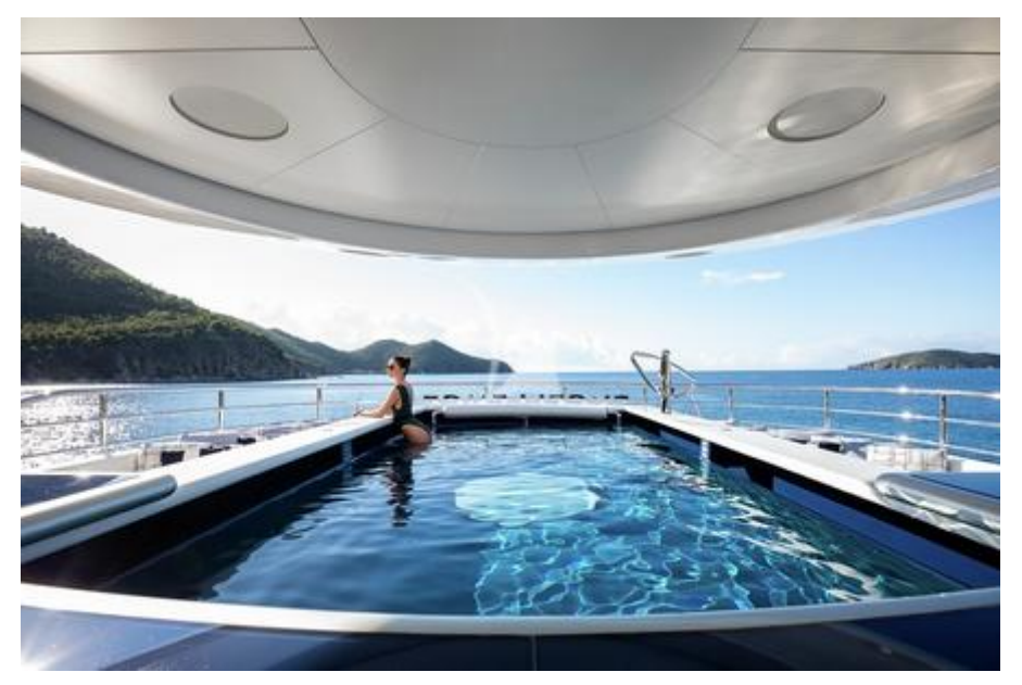
Main deck aft pool