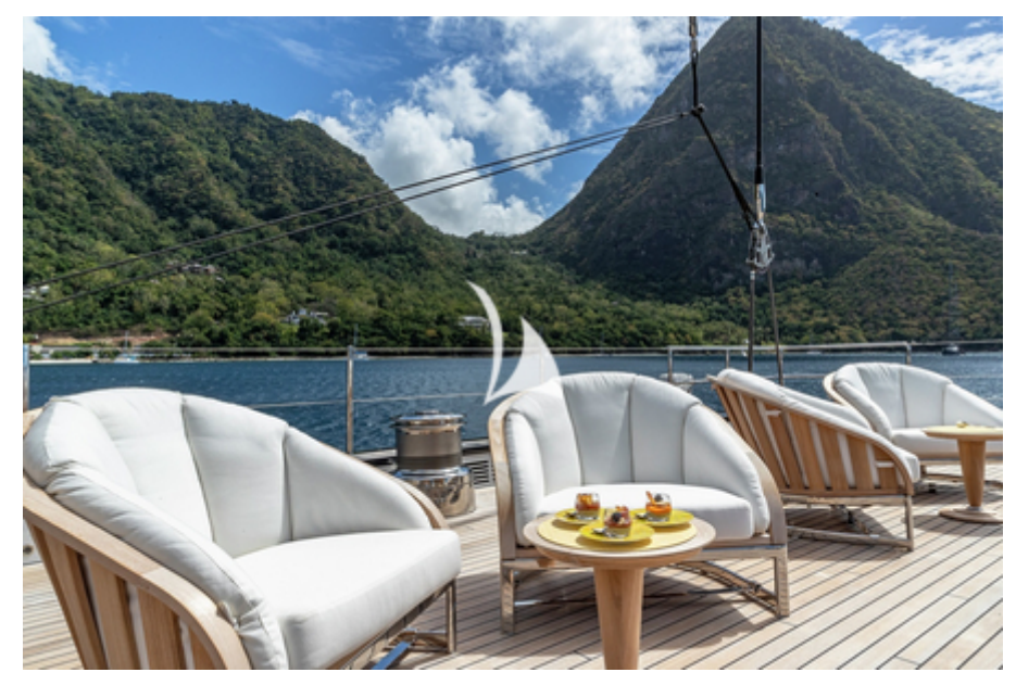
Aft deck seating