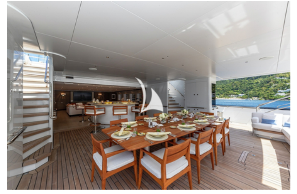
Aft deck dining opening onto the bar