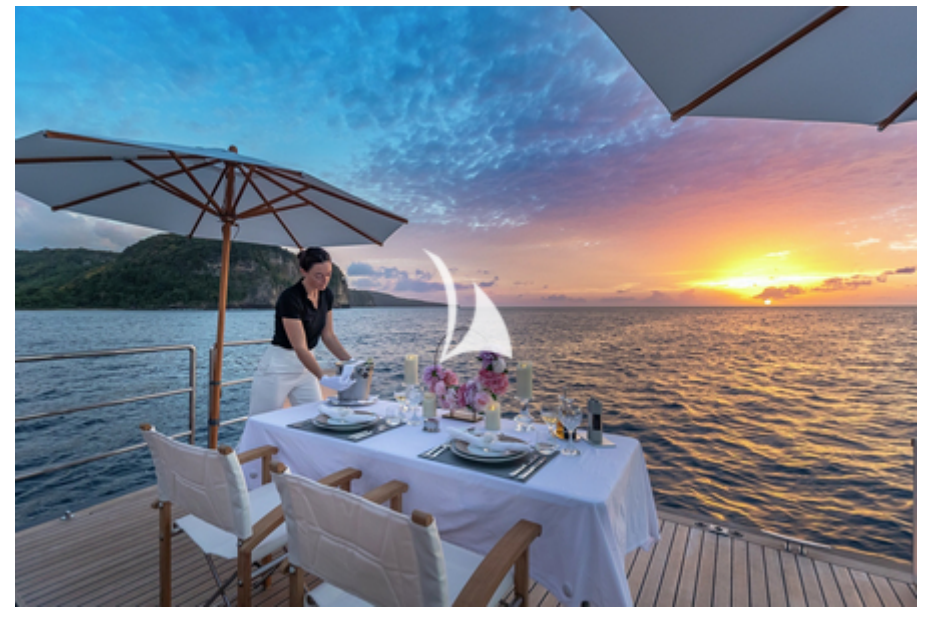
Swim platform romantic dinner