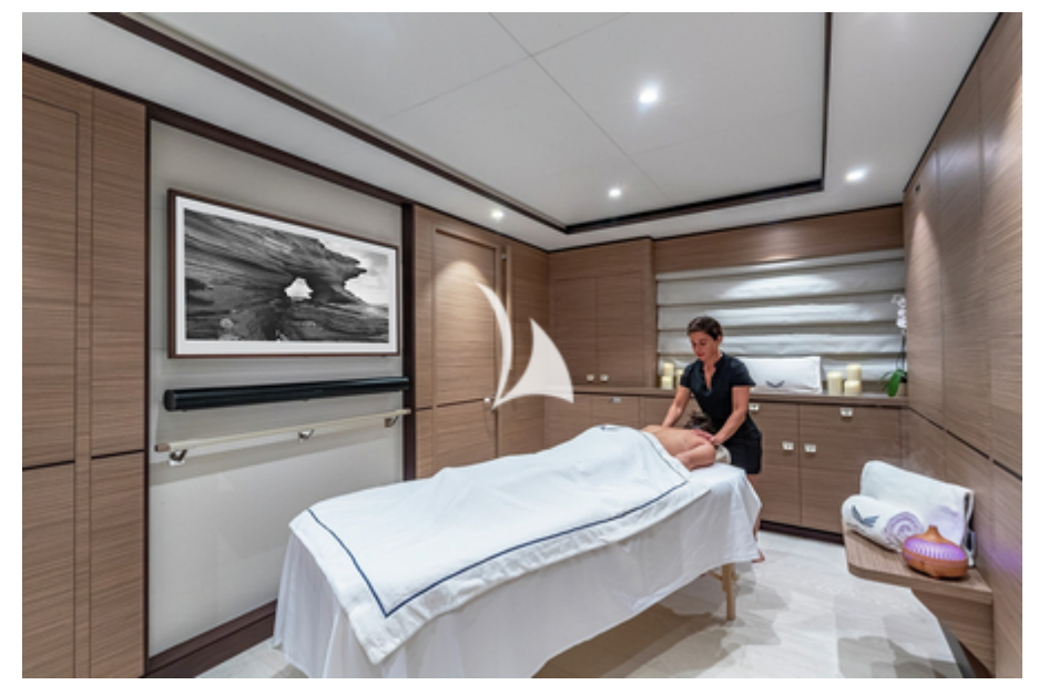
Flexible twin cabin or gym or massage room