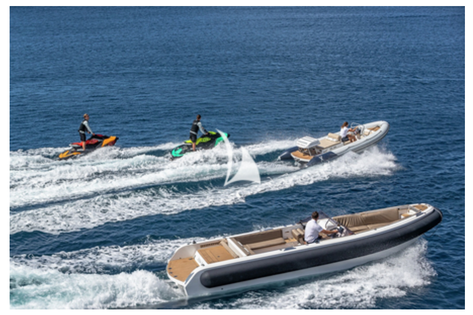
Tenders & toys