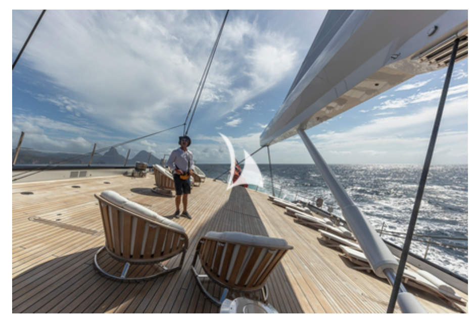
Aft deck under sail