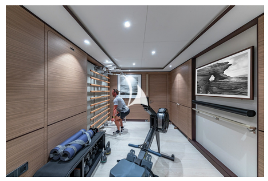
Flexible twin cabin or gym or massage room