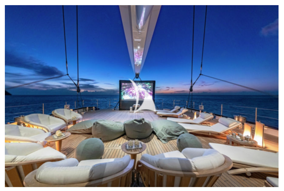
Aft deck cinema