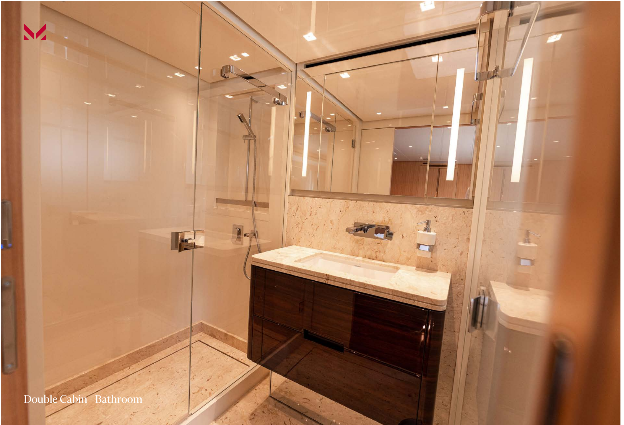
Double Cabin - Bathroom