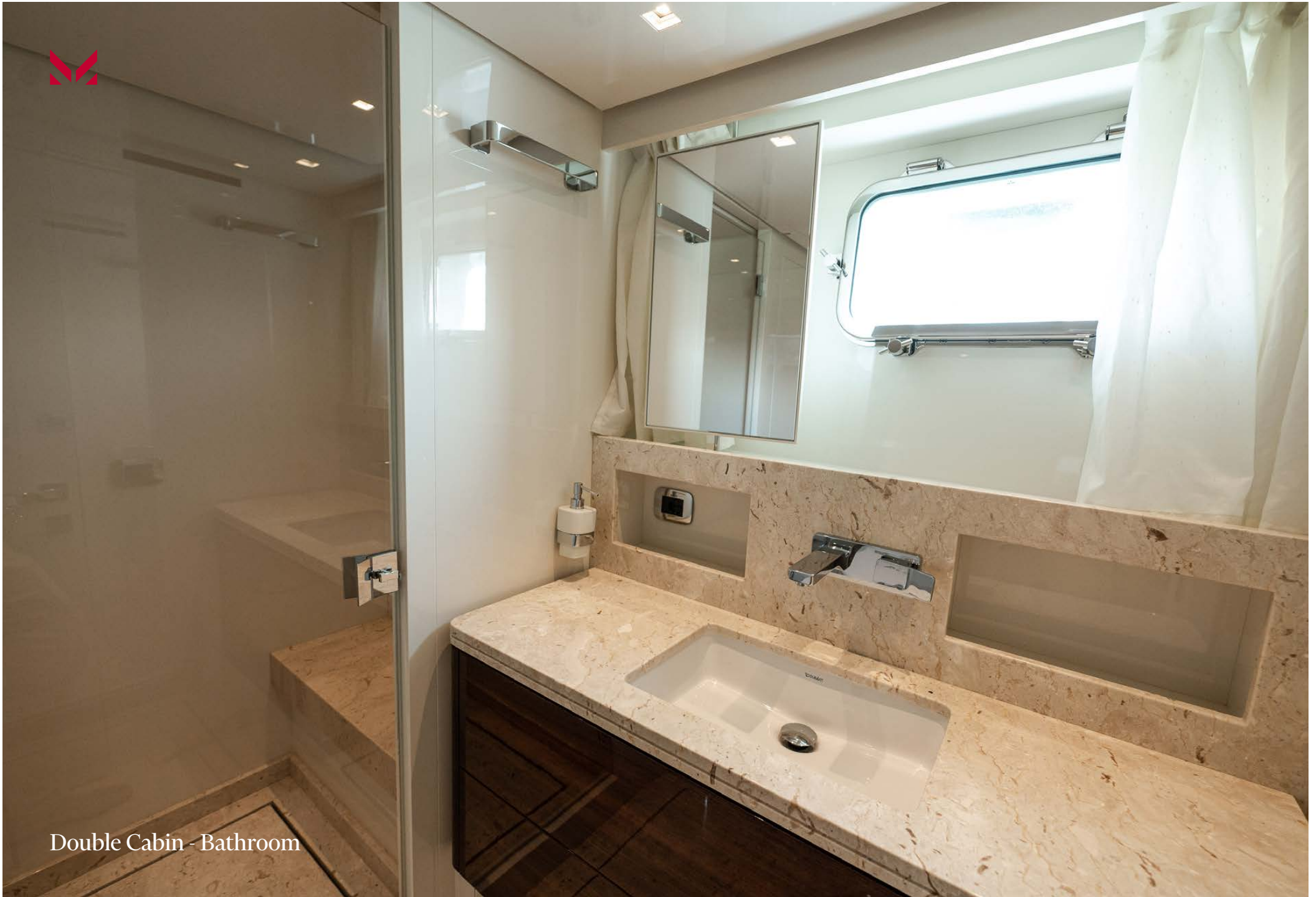
Double Cabin - Bathroom