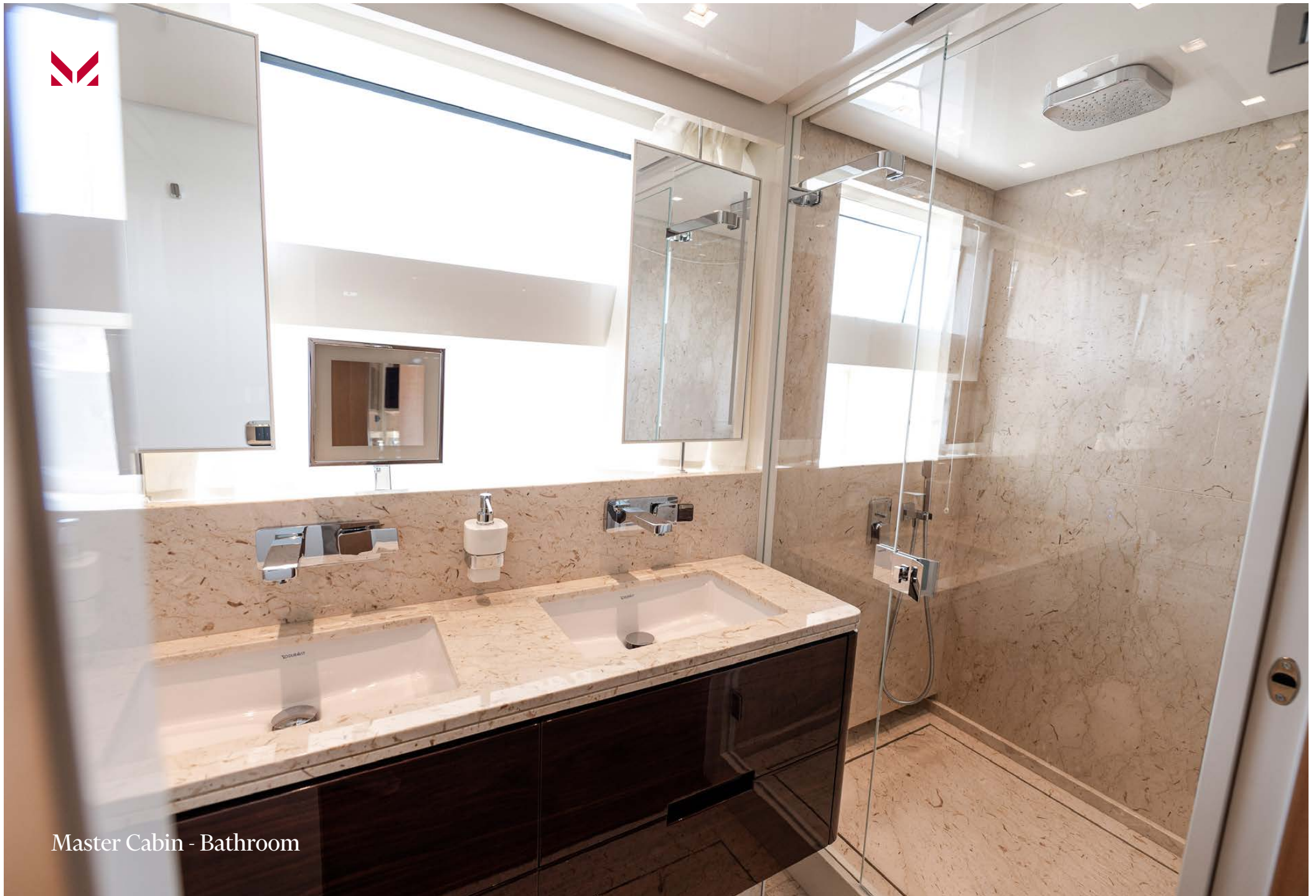
Master Cabin - Bathroom