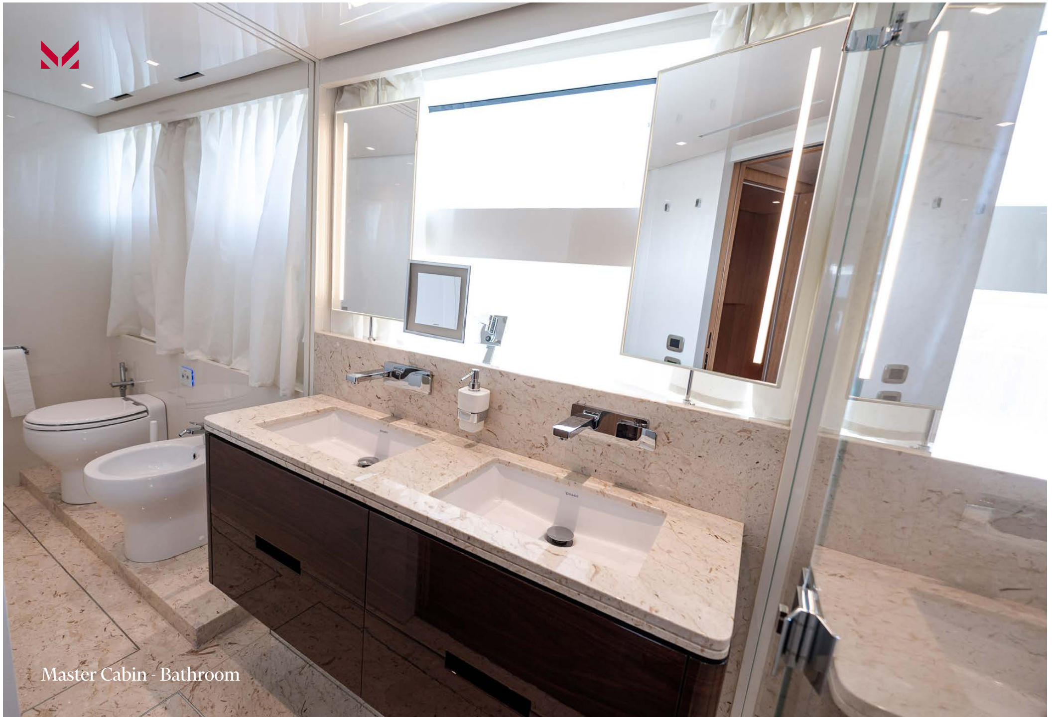
Master Cabin - Bathroom