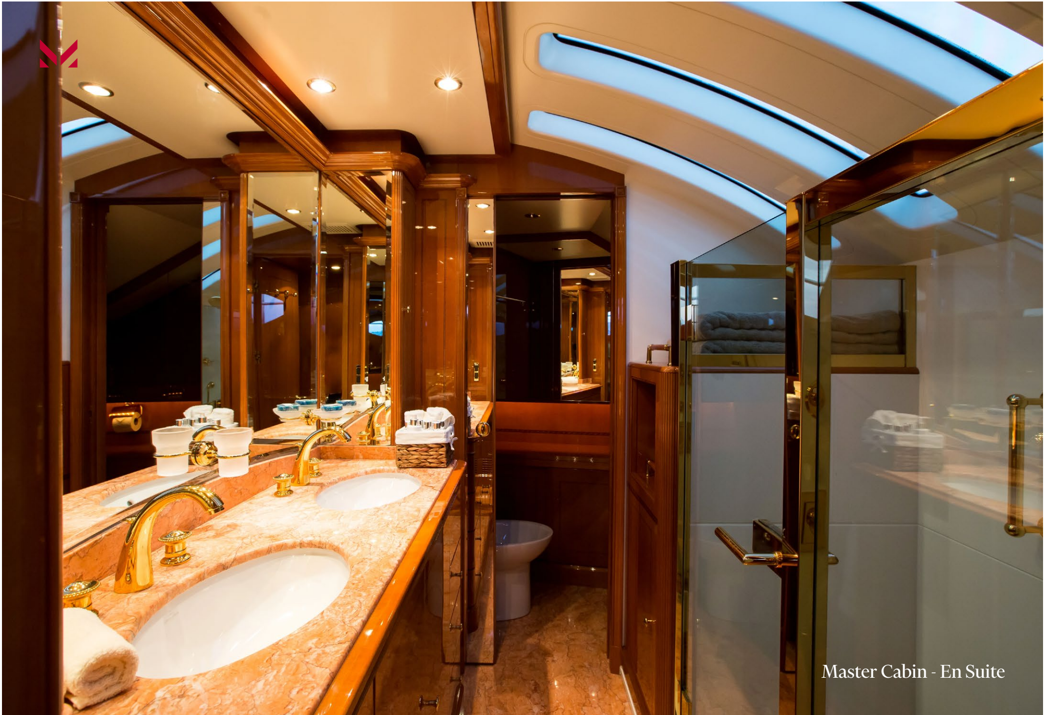
Master Cabin - En Suite