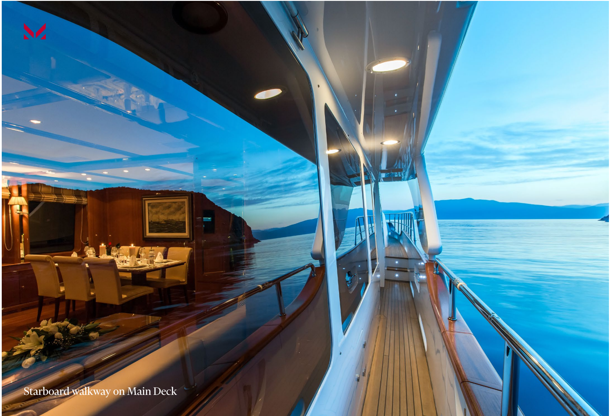
Starboard walkway on Main Deck