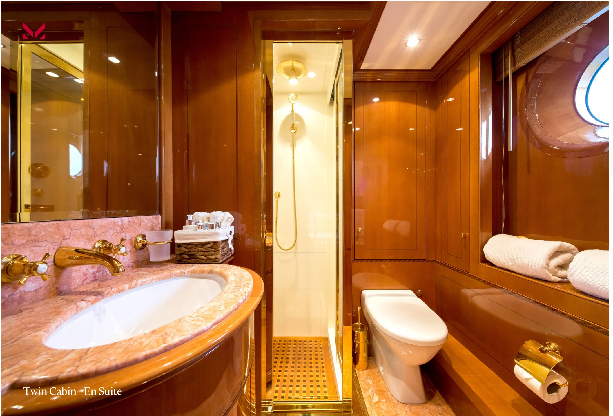
Twin Cabin - En Suite