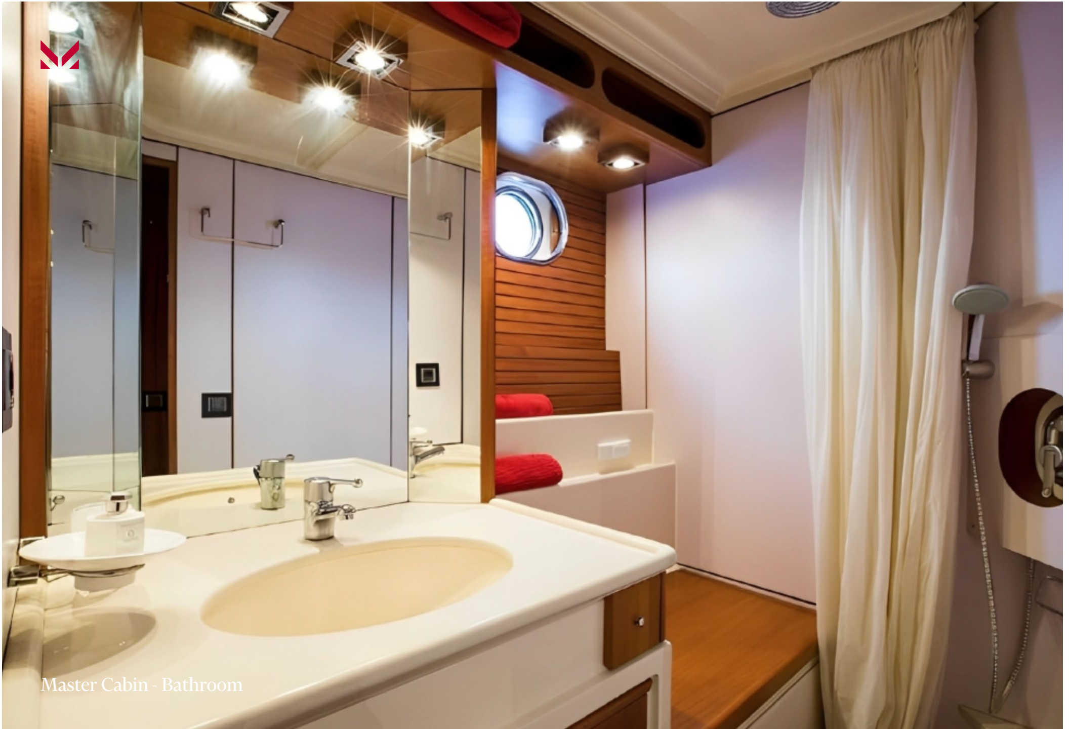
Master Cabin - Bathroom