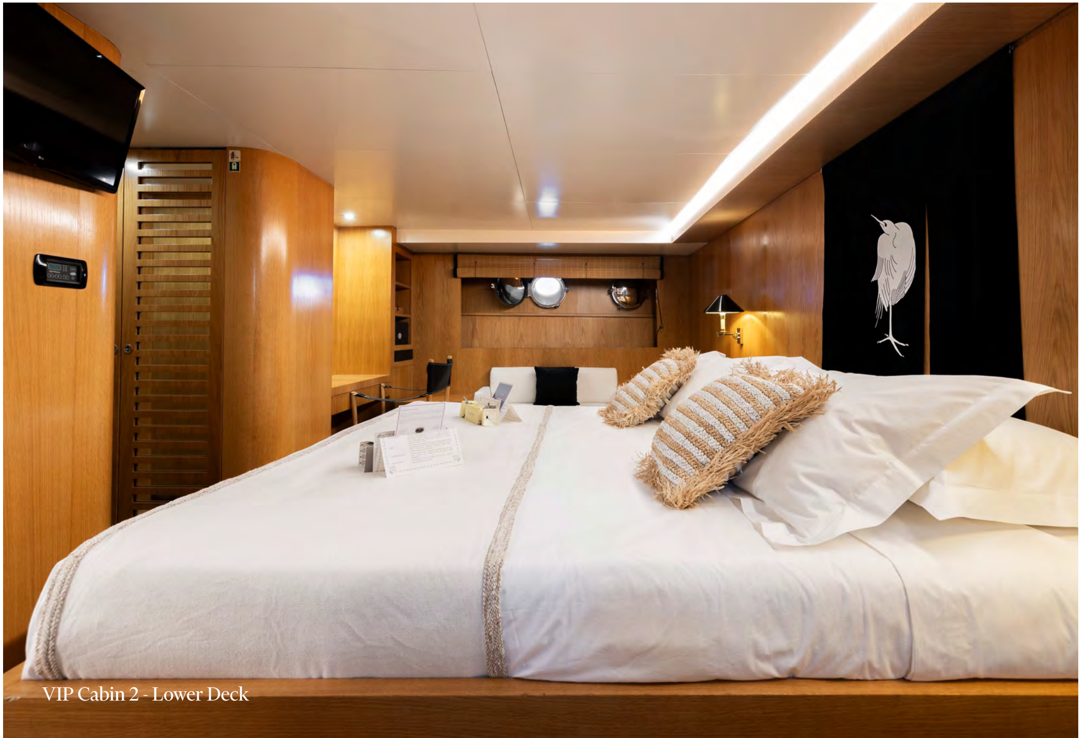
VIP Cabin 2 - Lower Deck