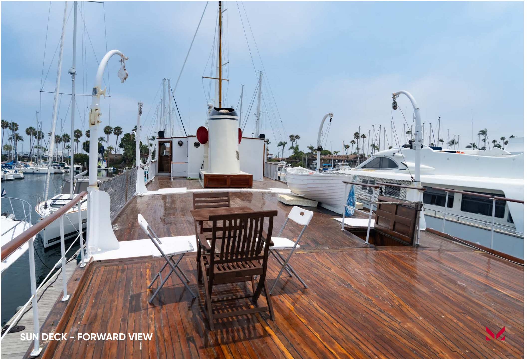
SUN DECK - FORWARD VIEW