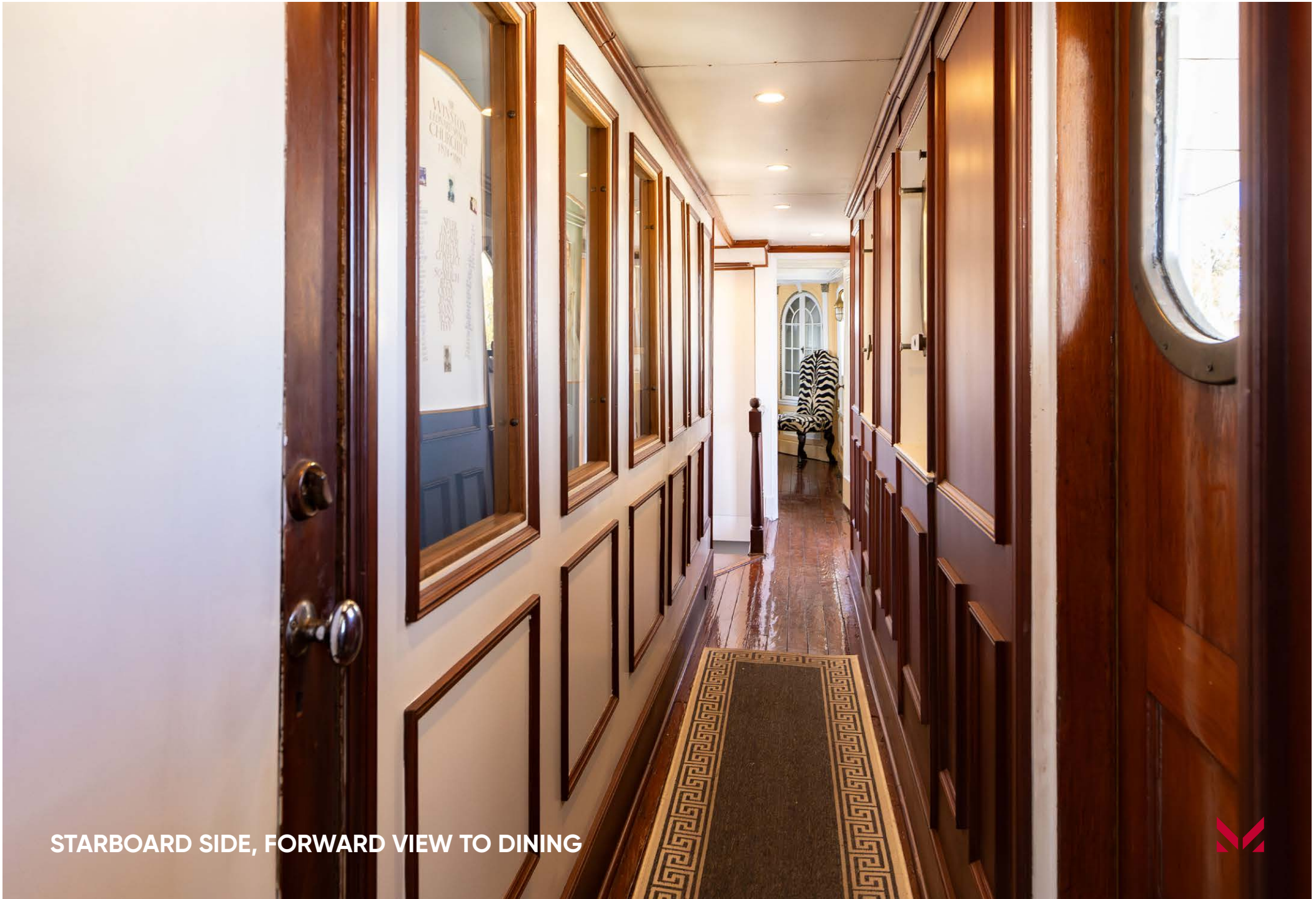
STARBOARD SIDE, FORWARD VIEW TO DINING