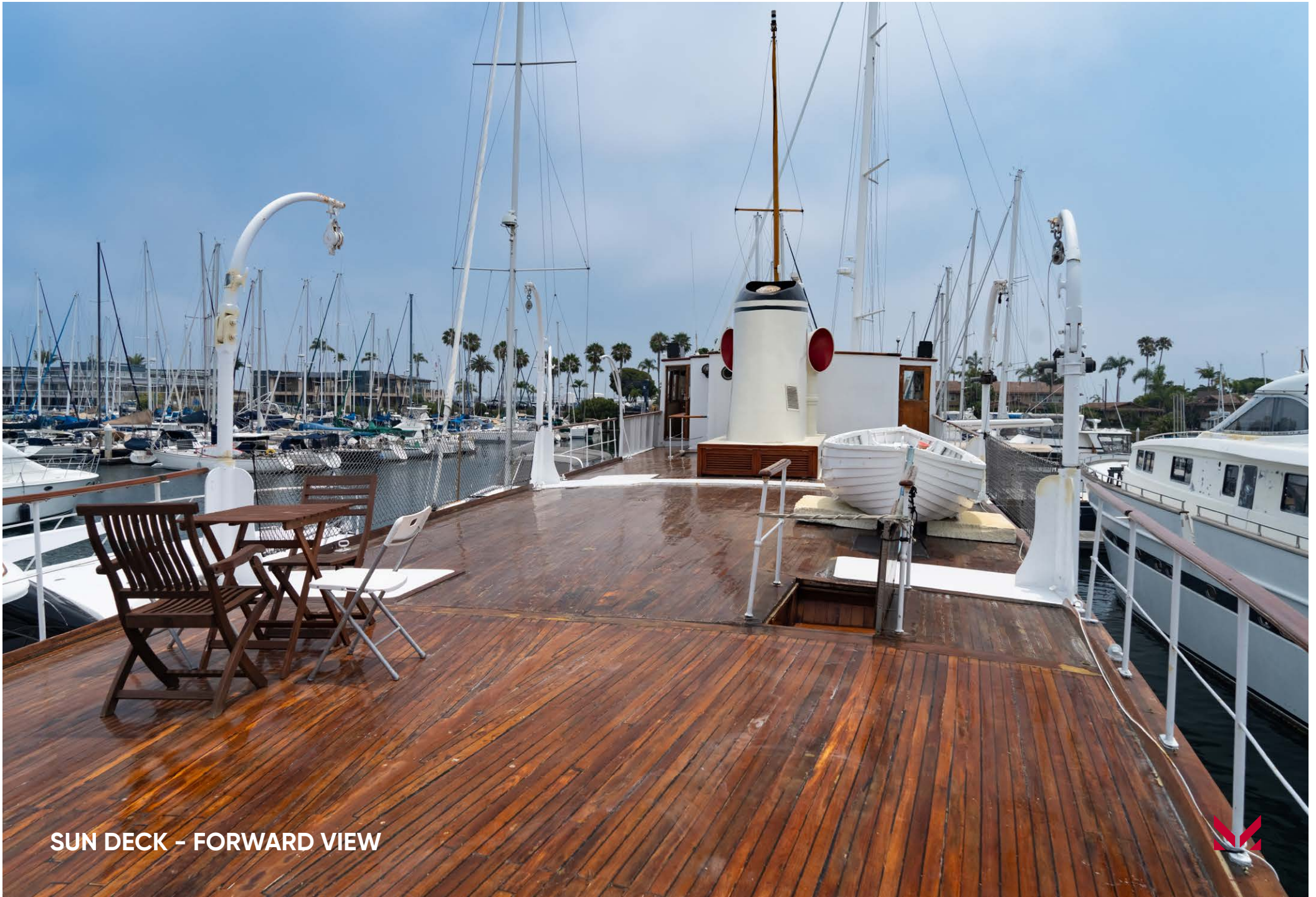
SUN DECK - FORWARD VIEW