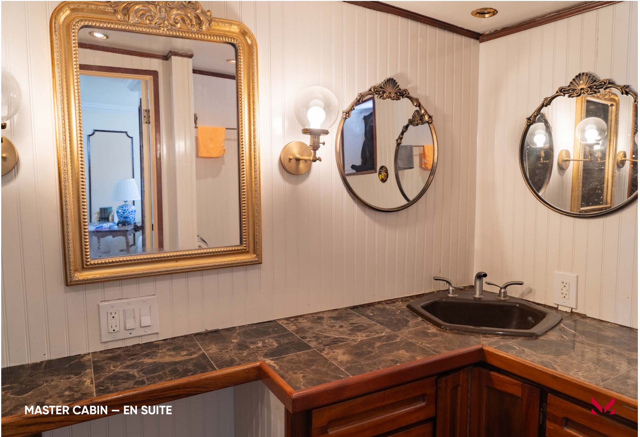
MASTER CABIN – EN SUITE