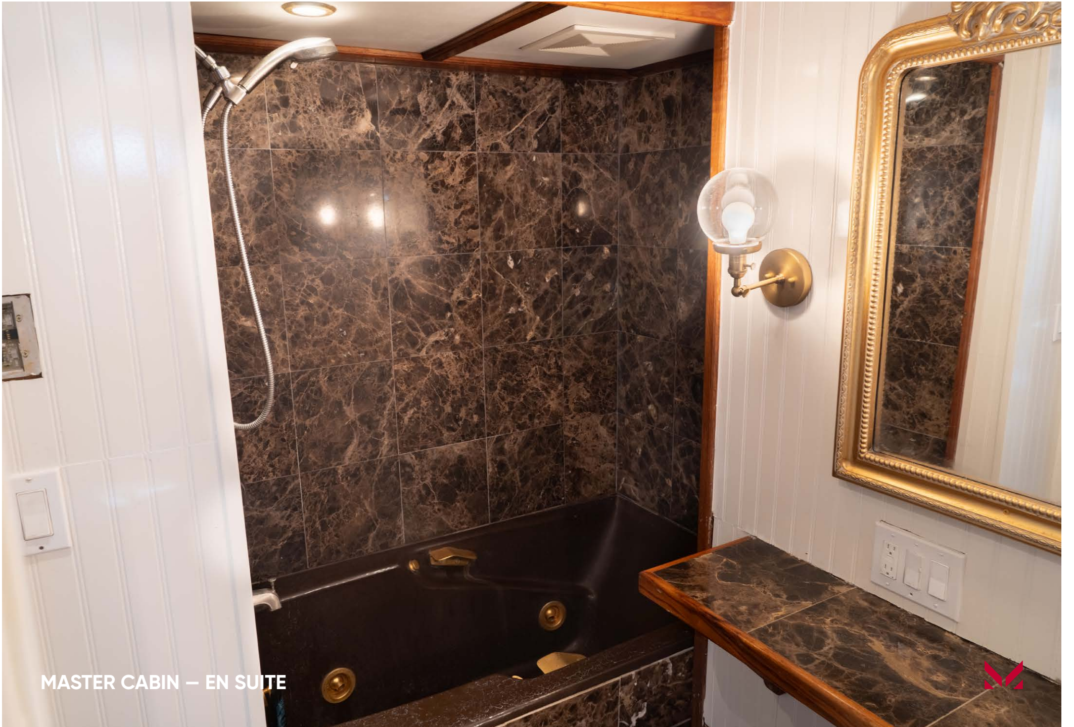
MASTER CABIN – EN SUITE