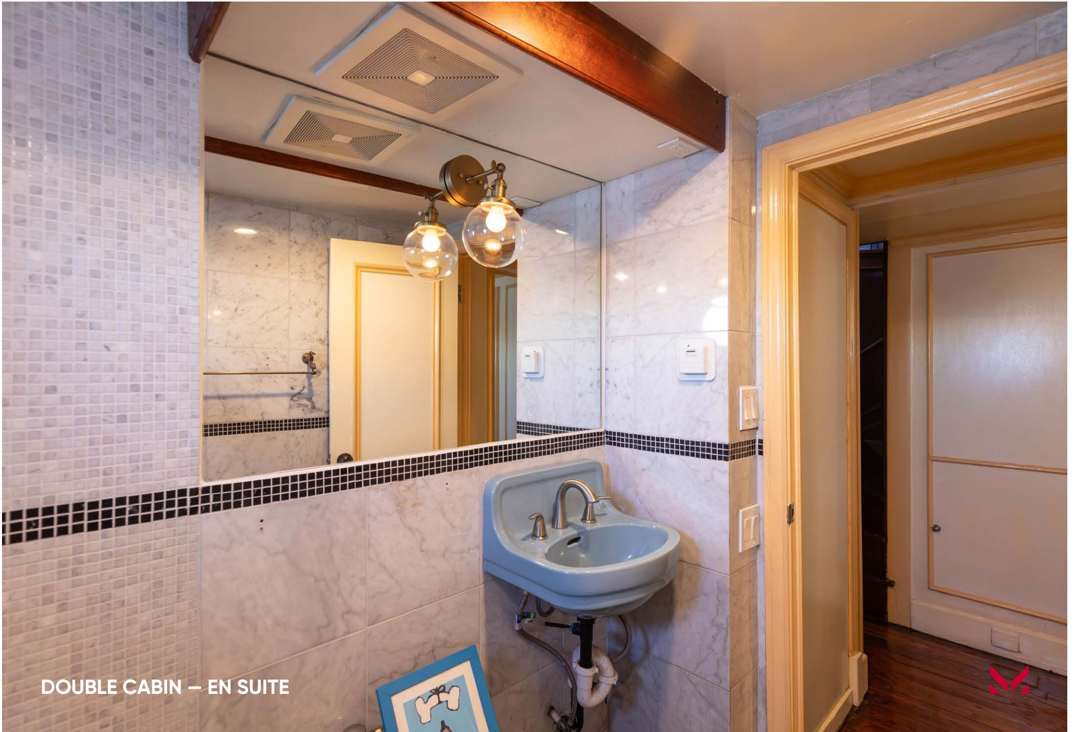
DOUBLE CABIN – EN SUITE