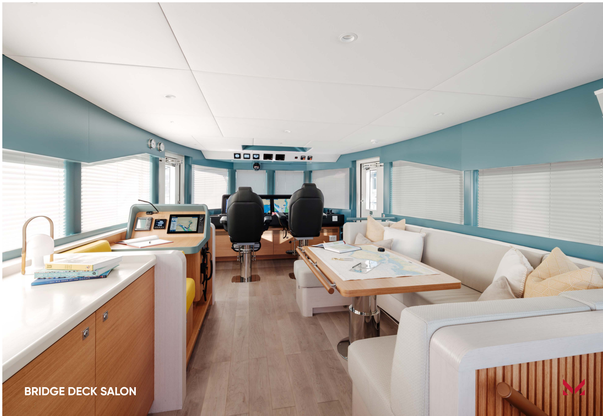
BRIDGE DECK SALON