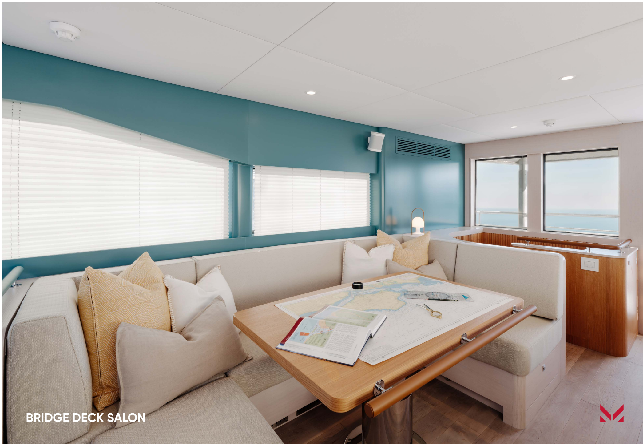
BRIDGE DECK SALON