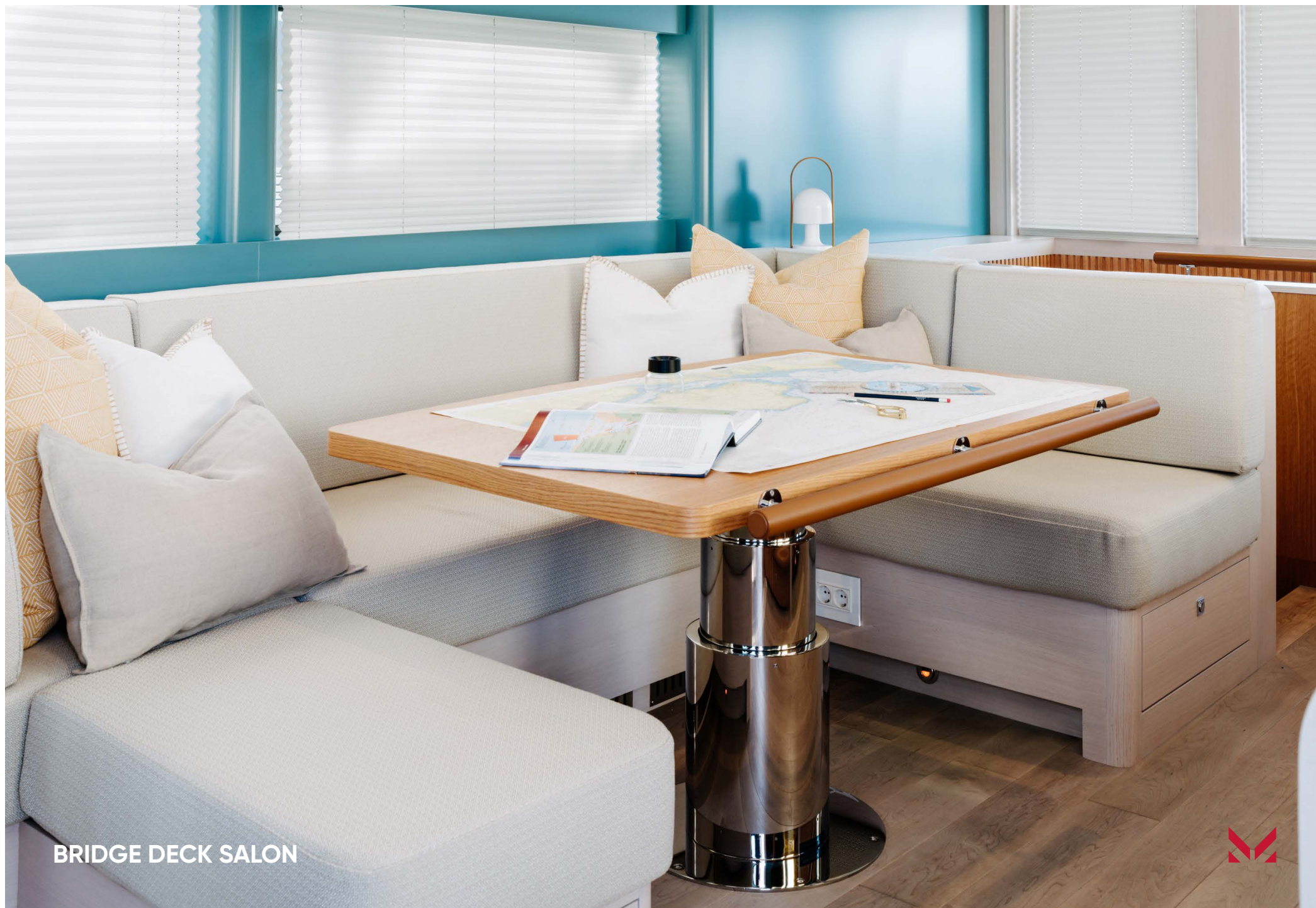
BRIDGE DECK SALON