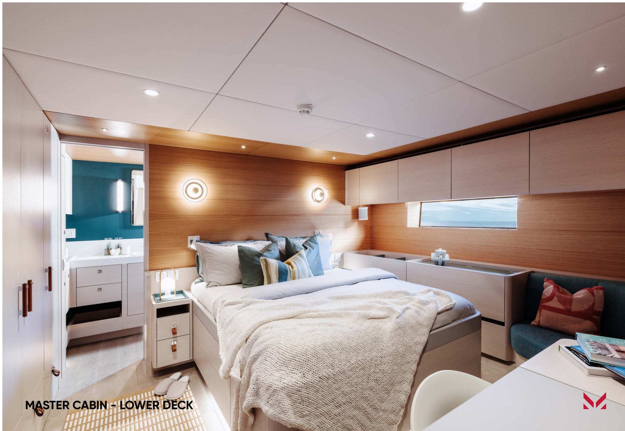
MASTER CABIN - LOWER DECK