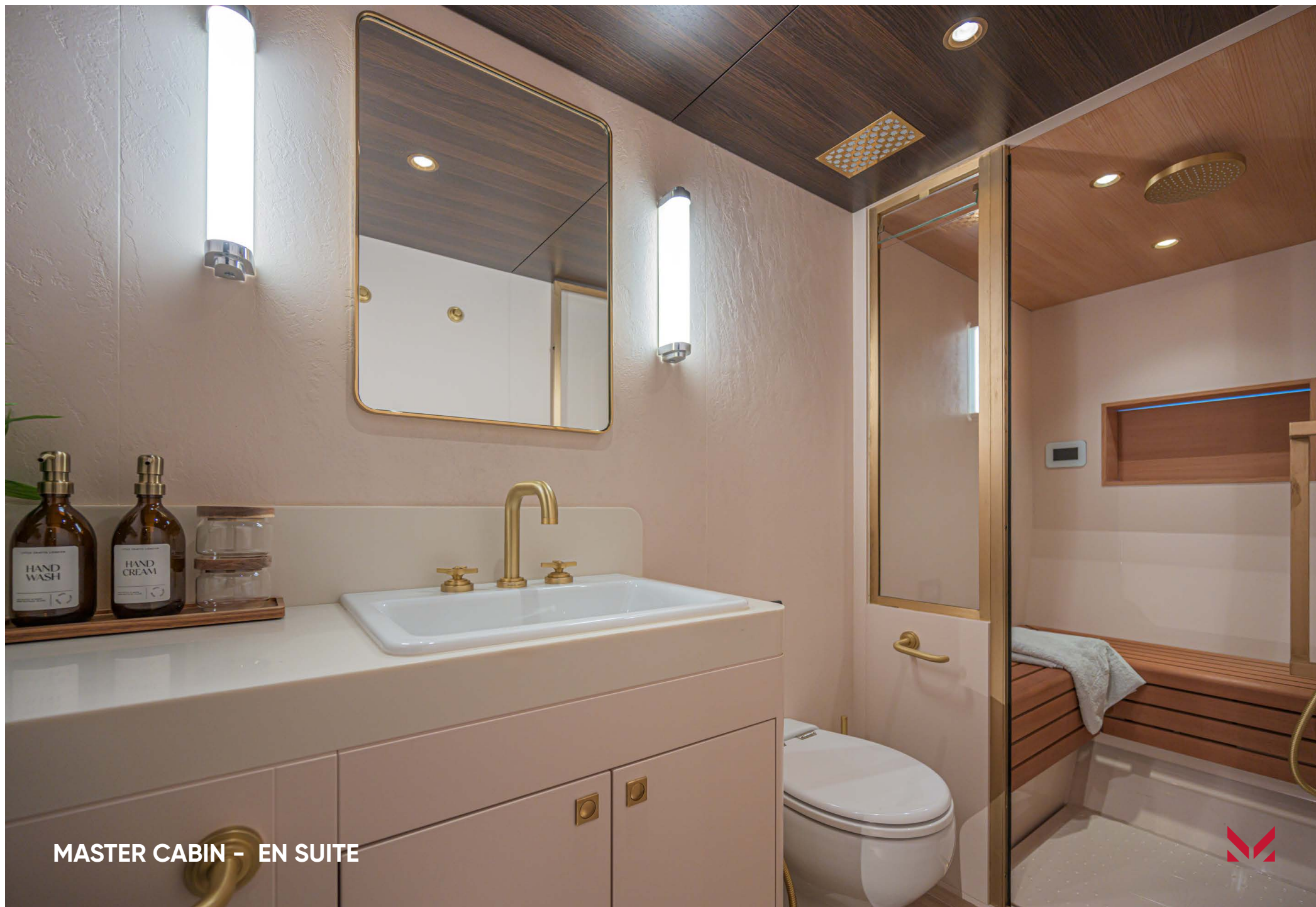
MASTER CABIN - EN SUITE