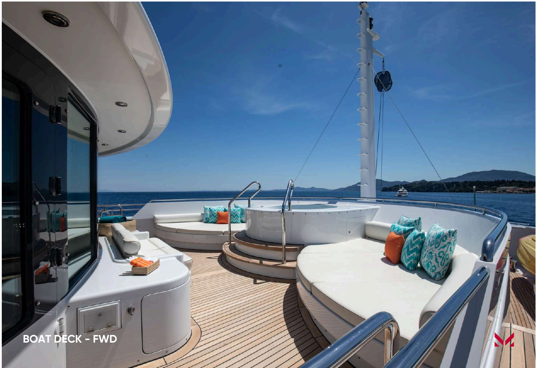
BOAT DECK - FWD