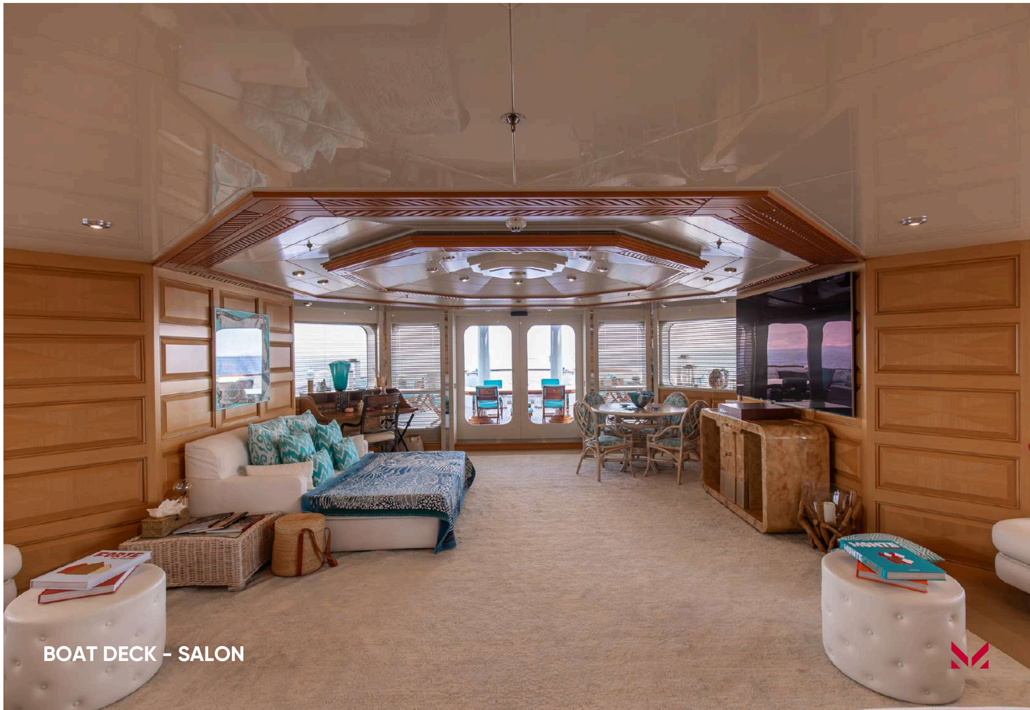
BOAT DECK – SALON