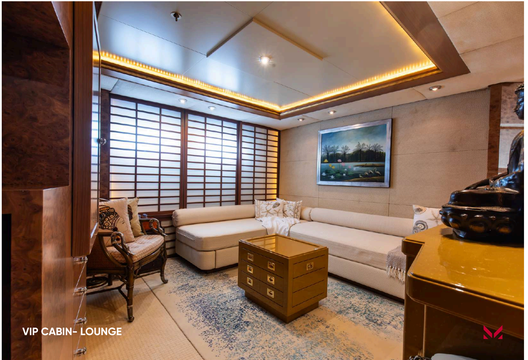
VIP CABIN- LOUNGE