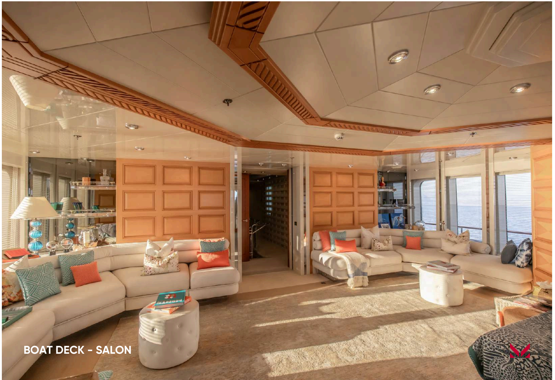
BOAT DECK - SALON