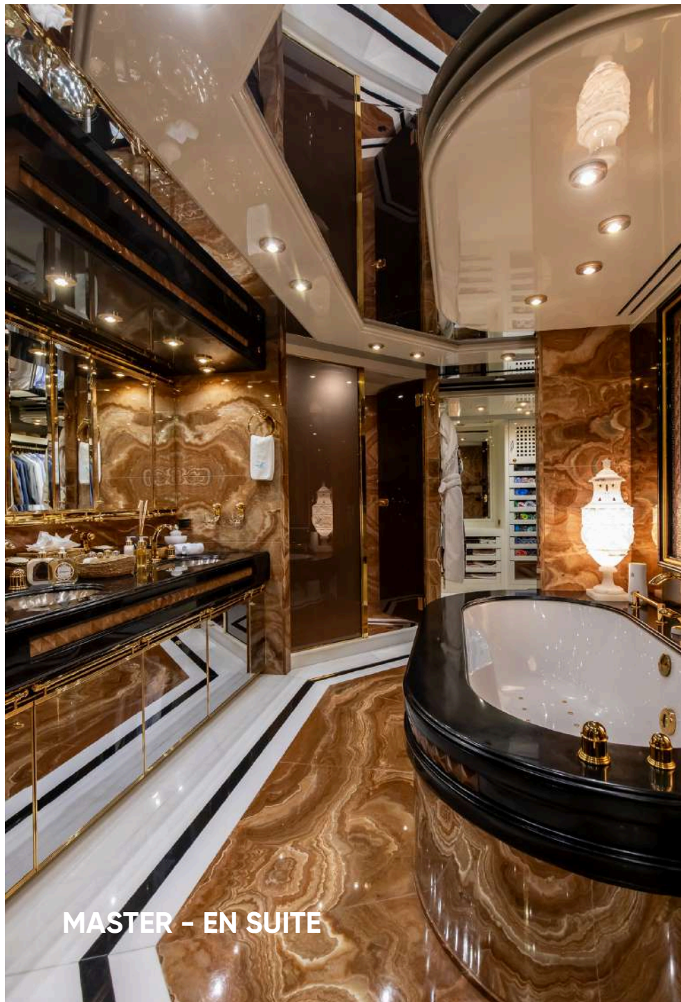
MASTER - EN SUITE