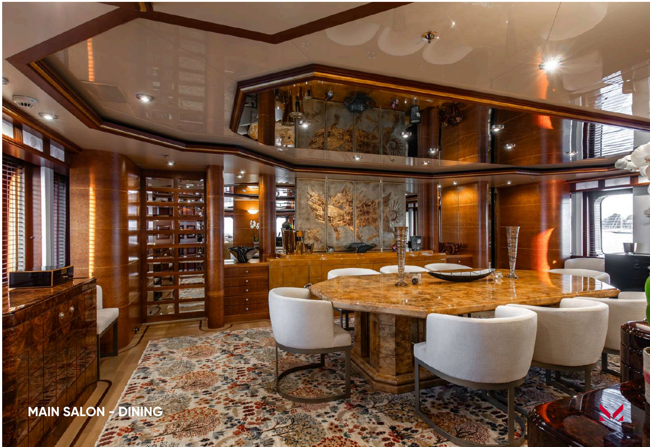
MAIN SALON - DINING