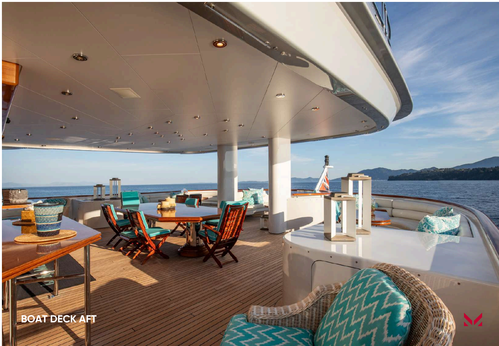
BOAT DECK AFT