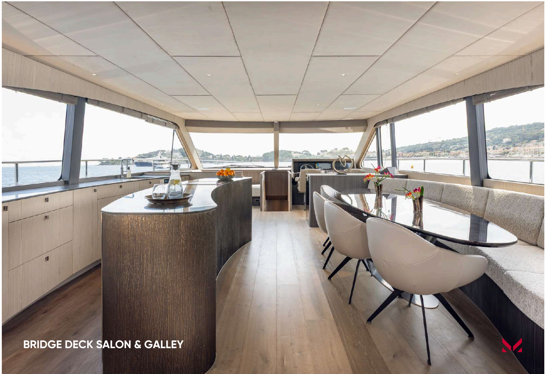
BRIDGE DECK SALON & GALLEY