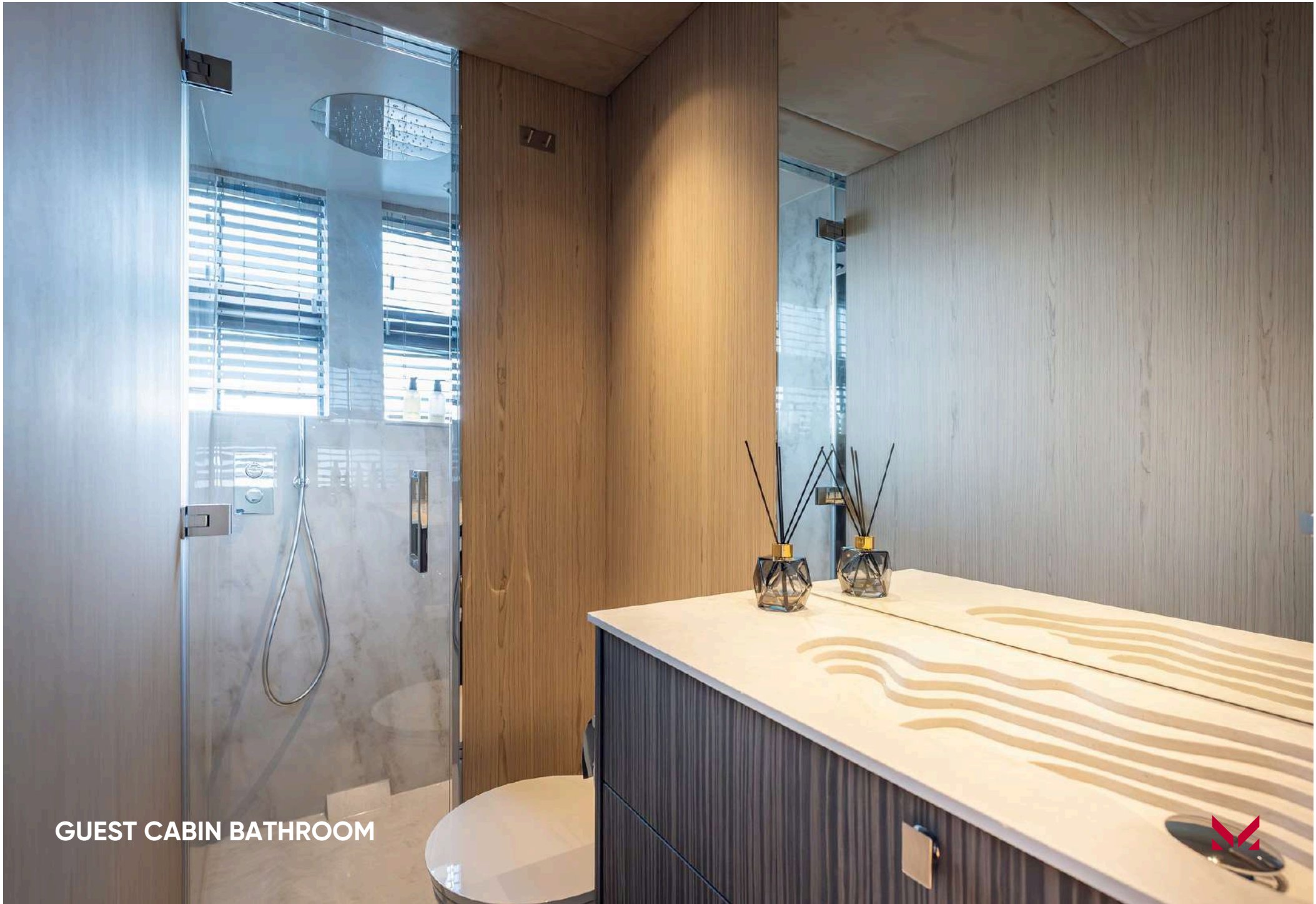
GUEST CABIN BATHROOM