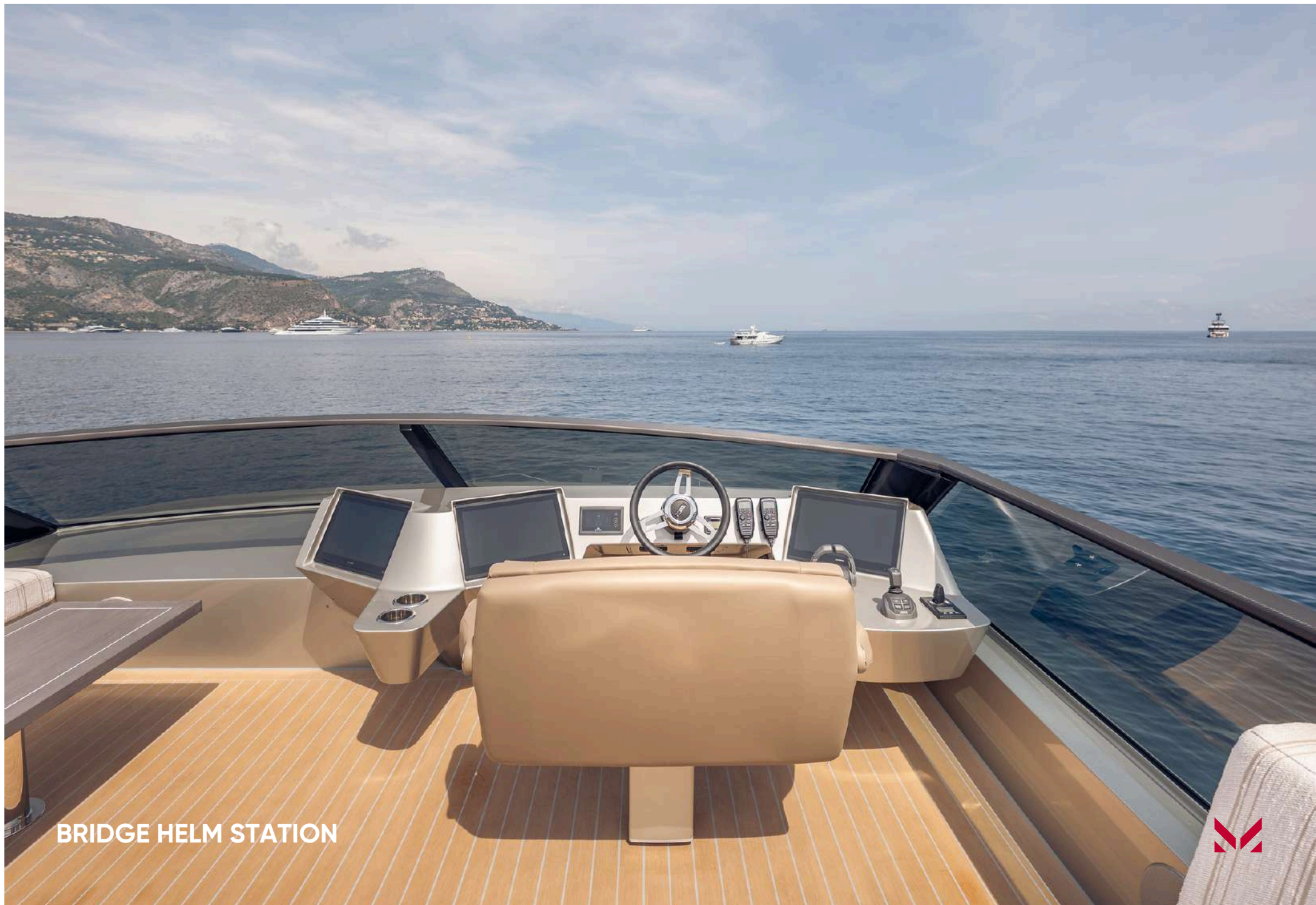
BRIDGE HELM STATION