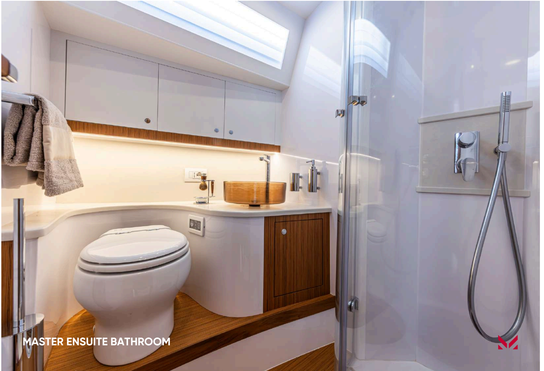
MASTER ENSUITE BATHROOM