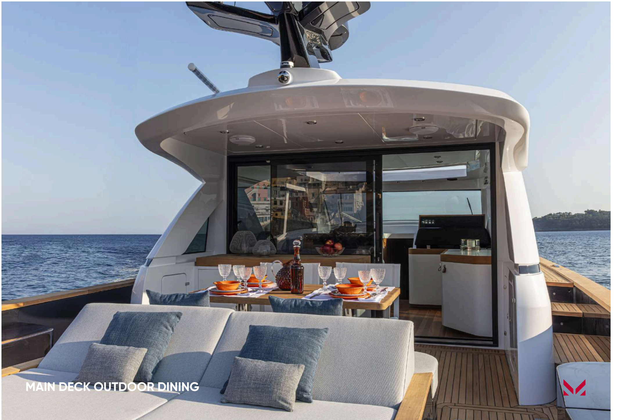
MAIN DECK OUTDOOR DINING