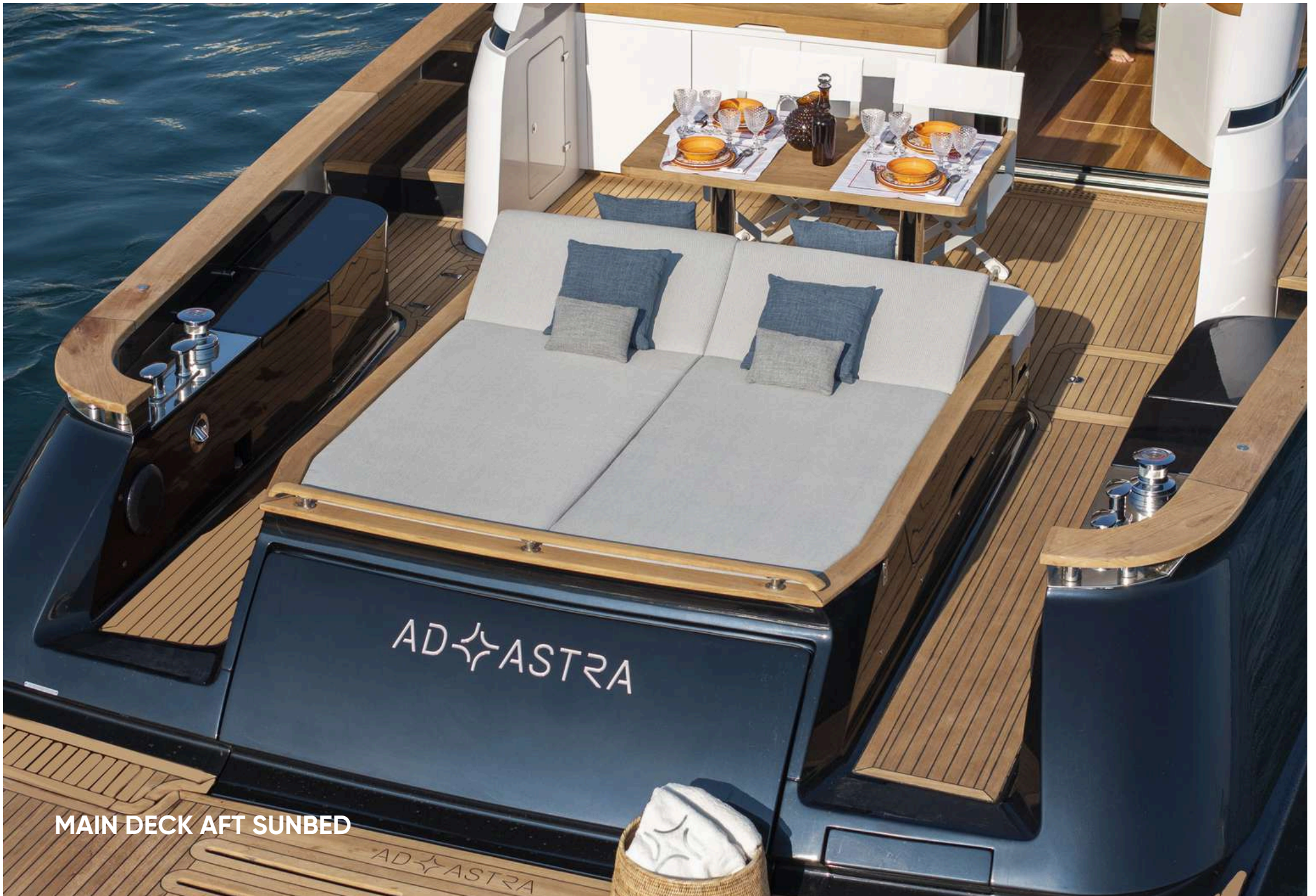
MAIN DECK AFT SUNBED